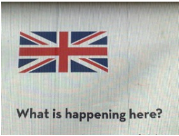
Fig. 5. Pictures accompanying the text "What is happening here?"