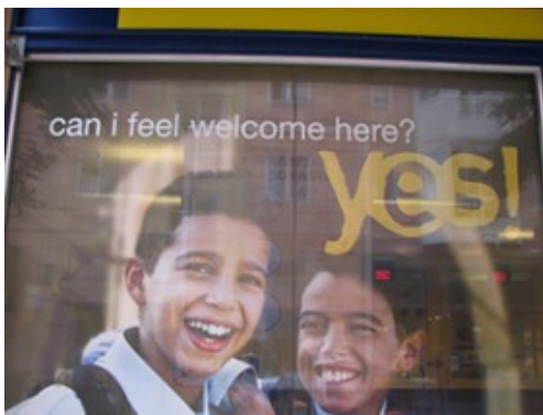
Figure 4. Pictures accompanying the text "Welcom!".

As in any other documentary genre, the documentary aspect of the flâneur texts seems to invite social commentary. For Barbro Rønning, encountering a boat named "Blessed" parked illegally outside a missionary organization's headquarters, the situation somehow seems to offer its own parody (Rønning). Another