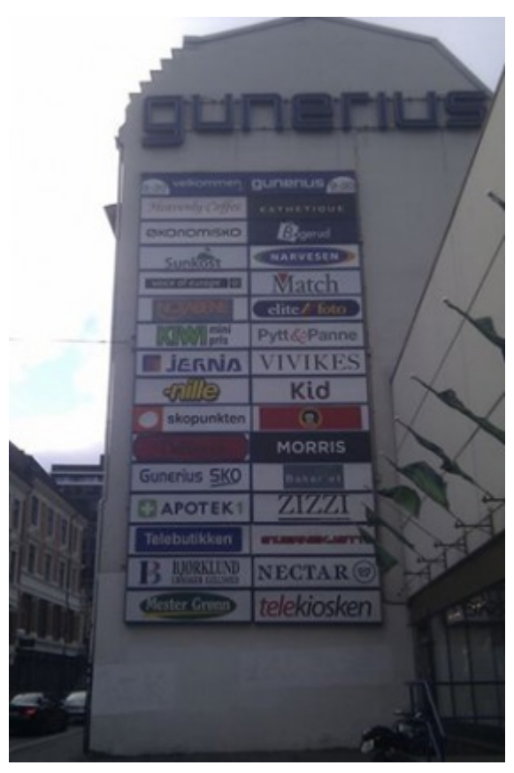
Figure 3. Advertising wall, downtown Oslo.

The experience described by Rettberg echoes my own, when testing the flâneur concept: I start reading the environment around me, noticing all the textual elements that urban life has trained me to ignore: Unusual place names, advertising posters whose glossy and oversexed invitations enter into absurd juxtapositions with the sometimes dreary environment, the incessant onslaught of prohibitions and the ominous fragments that can be picked up in overheard conversations of random passers-by: "But without that it is not possible to live!" (Løvlie, "Grønland Basar"). Once I had started work on the flâneur game<sup>9</sup>. I could not walk by a wall such as the one pictured below without trying to figure out how to puzzle the names of the shops into a story – even though I had passed by that wall countless times before, always ignoring its contents.