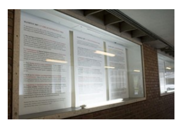
Figure 2: «Manifesto», art installation in advertising monter at Tøyen metro station in Oslo.

Countless such gestures are made both within and outside of the art institutions, in an effort to connect with wider audiences – but for reasons that are all too understandable, these efforts are nearly always limited in time and space: It is not practically possible to have art and literature installed everywhere, all the time . Or at least not without the use of spatial annotation and locative media. These techniques make it possible for texts to enter my everyday space, and yours , wherever it may be; in other words, a medium that is present in every location where it has an audience. In such a medium, the users of the system can no longer be confined to a role as passive receivers of "content". Since the gallery space has been replaced with the user's own everyday spaces, the users must be granted the maximum possibility to enter into an active role as producers and editors of "publicly created