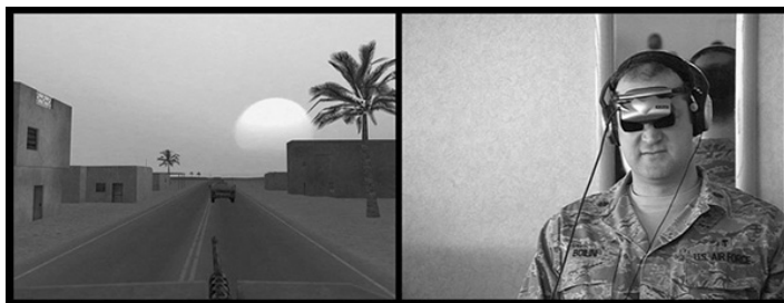
[Figure 1] Harun Farocki, Serious Games I–IV , 2001.

In its multi-screen architecture, the installation most strenuously insists on a disjuncture between the camera apparatus and the human eye. Vision, for Farocki, is an activity beyond and outside of the human subject. It is a product emerging from the realm of machines and apparatuses of capture, one that retroactively conditions and manufactures “human” vision. At the limits of his analysis is the possibility that vision—at least in the human capacity to survey—is impossible, even as the ability of machines to record, store, memorialize, and reenact images has never been greater. More critically, it would appear that machinery is capable of rewiring the human brain. What Farocki addresses is that our very vision and cognition are now thoroughly mediated. Vision has become in many ways mechanized, perhaps even inhuman in being unable to recognize human subjectivity.