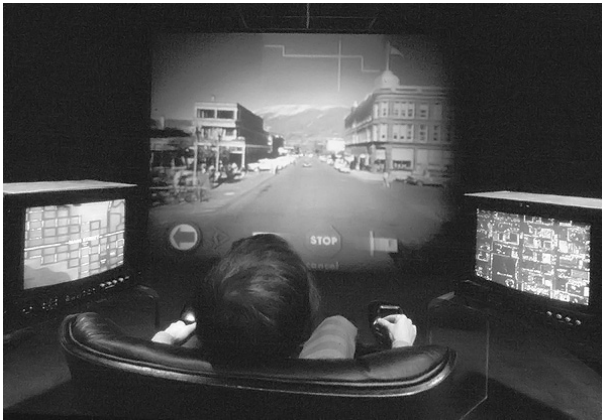
[Figure 2] The Aspen Movie Map, Architecture Machine Group at MIT, 1978–1979, https://www.youtube.com/watch?v=Hf6LkqgXPMU .

Arguably one of the most important models for the contemporary responsive environments and virtual reality therapies, like the one in Farocki’s Serious Games , is historically the Aspen Movie Map (fig. 2). Built through the careful survey of gyro-stabilized cameras that took an image every foot traversed down the streets of the city of Aspen in Colorado, the Aspen Movie Map was a system working through laser discs, a computer screen and a joystick that allowed a user to traverse the space of the city at their leisure and speed.