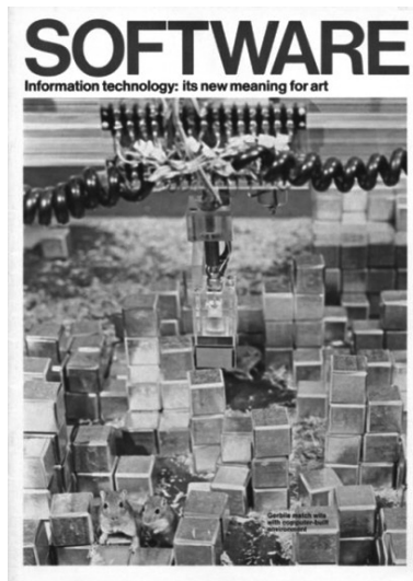
[Figure 4] Software : cover of the exhibition catalogue, 1970.

While beginning with humans, Negroponte and his Architecture Machine Group quickly turned away from conversations, interviews, and Turing tests to move towards immersive environments and a new frontier: art. They designed a micro-world called SEEK (fig. 4) for the famous Software exhibition held at New York's Jewish Museum in 1970. The installation consisted of a small group of Mongolian desert gerbils (chosen according to Negroponte for their curiosity and inquisitive nature), which were then placed in an environment of clear plastic blocks that was constantly rearranged by a robotic arm. The basic concept was that the mechanism would observe the interaction of the gerbils with their habitat (the blocks), and would gradually "learn" their living preferences by observing their behavior. This "cybernetic machine" understood the world as an experiment, but also meant the introduction of cognitive and neuro-scientific models of intelligence into the environment. Apparently, traumatizing gerbils was a route to better computer-aided design.