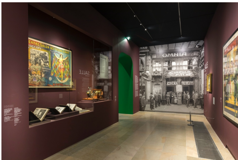
Fig. 3: Vue de l'exposition Enfin le cinéma ! au musée d'Orsay.