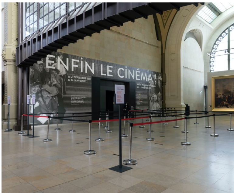
Fig. 1: Vue de l'exposition Enfin le cinéma ! au musée d'Orsay.

and to examine this period before the introduction of film rentals by Pathé and the advent of cinema shows with seated audiences. This transition is subtly suggested in the exhibition's design.