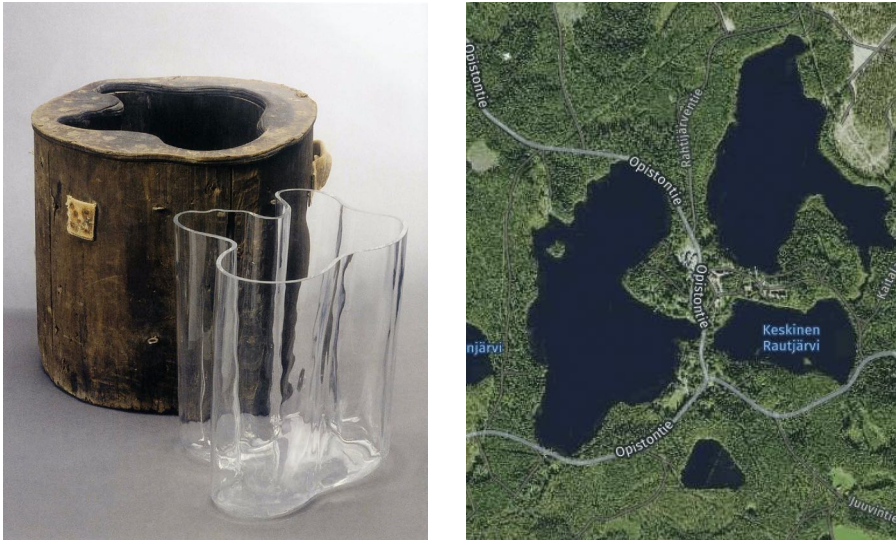
Figures 4 and 5: left : Alvar and Aino Aalto: Savoy Vase, 1936. right : Location of the Forest Academy in Evo, Southern Finland, founded in 1862.