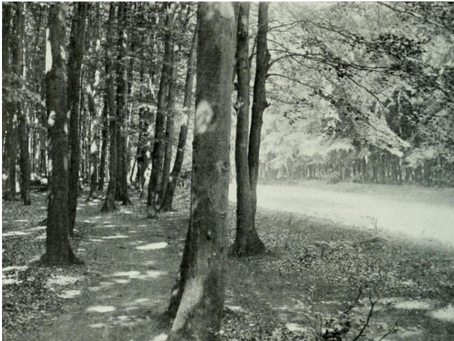
Figure 7: Sonnenflecke (nach Photographie). Scan: Salisch, Forstästhetik , 1911, p. 42.

Another example is this picture with the subtitle “Sunspots”. In the foreground there are bright dots on the trunk of a tree and on the ground—accompanied by a bright, cleared area next to the cluster of trees—apparently a clearing.