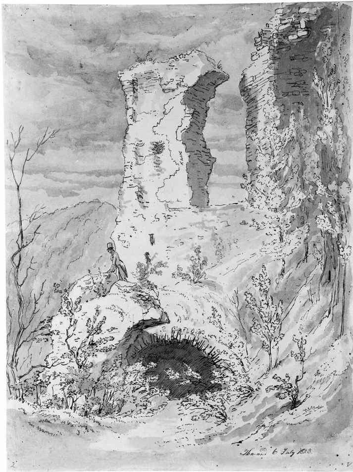
Figure 2: Carl Blechen: Burgruine Tharand bei Dresden , 1823. Kupferstichkabinett, Staatliche Museen zu Berlin.

The forestry school in Evo in Southern Finland serves as another example of the close interactions between foresters and artists. The school was founded in 1862 by Finnish foresters who were trained in Tharandt. The artist Helene Schjerfbeck was a niece of one of the forestry teachers and spent a lot of time at the school. Many of her paintings found inspiration in forestry motives.