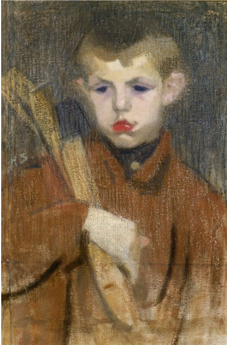
Figure 3: Helene Schjerfbeck: The Woodcutter , 1910-11. Finnish National Gallery.

There are in fact several influential artists with connections to this forestry academy, one example of which is Alvar Aalto. His designs are known to have been inspired by Finnish nature and organic shapes. Aino and Alvar Aalto's famous Savoy vase, for instance, could be compared to the form of a lake. The Evo forestry academy is located in the middle of three lakes.