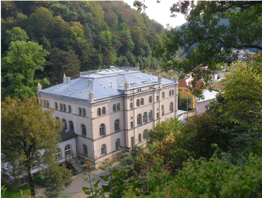
Figure 1: The Royal Saxon Academy of Forestry in Tharandt was founded in 1808. The academy building was constructed in 1847.

place in the network of academic forestry. König and other early founders of forestry schools started their education here.