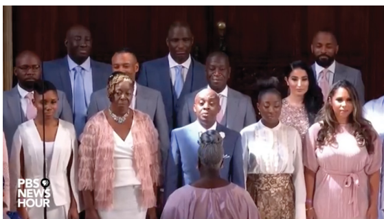
Fig. 9: Kingdom Gospel Choir performs at the wedding of Meghan Markle and Prince Harry (PBS, News Hour, 21 May 2018, 00:38:50). 11

Austria (and, we would argue, also in the rest of Europe) are designed by paid wedding planners as idealistic and individualistic rituals, the sequence that is followed in the preparation and the ritual itself is highly standardized, although open to individual adaptations. 12