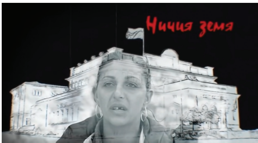
Video 1. Nichia Zemja , “The Third World Marries the Second One in Order to Reach the White One,” May 25, 2019.

One episode of NZ focuses on the already well-publicized story of a scam in which Roma women enter fake marriages with non-EU citizens. Under this scheme, the Roma women receive a payment while the men, who are primarily from Pakistan, Bangladesh, and India, obtain the privilege to travel and live in the EU. The title of the episode, “The Third World Marries the Second One in Order to Reach the White One,” embodies the racial anxieties which underpin the post-socialist condition. 34 The Second World, to which Bulgaria belongs, features as a midpoint between the white EU and the black “Third World.” In this worldview Bulgaria features as a peripheral entry point of the EU but it is not quite as white as Western Europe. Thus, this episode is reflective of the perennial feelings of inferiority and backwardness of Eastern Europeans, which throw into question their whiteness.