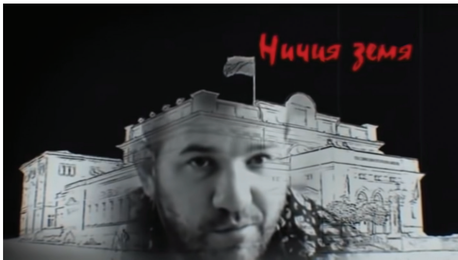
Video 2. Nichia Zemja, "A Hero of Our Time," March 4, 2017.