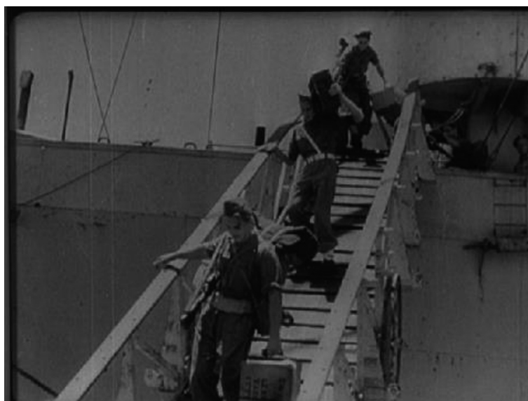
Photo 7. Linggadjati in de branding , a documentary explaining the military actions of the Dutch in Indonesia, 1947. Go to the online version of this article to watch part 1 of the documentary.

With the transfer of sovereignty in 1949, the future of the films produced by the Gouvernements Filmbedrijf Multifilm Batavia was uncertain. Several fires in the film studios in Jakarta in the beginning of the fifties destroyed much of the original footage, but copies of the edited films and newsreels were kept by Multifilm Haarlem, the parent company of Multifilm Batavia. In 1953, the Indonesian government asked Multifilm Haarlem for these copies, which they considered to be part of the cultural heritage of Indonesia. Multifilm was willing to ship the films but also asked for the support of the Dutch ministry of Foreign Affairs to finance copying and preserving these films as part of the Dutch cultural heritage. After some haggling, about 40% of the films were copied and stored in the vaults of the Dutch Government Information Service (RVD) near The Hague. The collection became once more complete when, at the beginning of the eighties, the Indonesian government asked for help with the conservation of the films in their possession. They were shipped back to