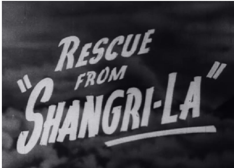
Photo 3. Title sequence from Rescue from Shangri-La , a film by the Dutch Government Film Service in Australia about a spectacular rescue of Americans in the interior of Dutch New Guinea. Go to the online version of this article to see the full video.