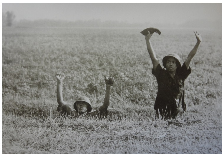
Photo 10. Indonesians arrested