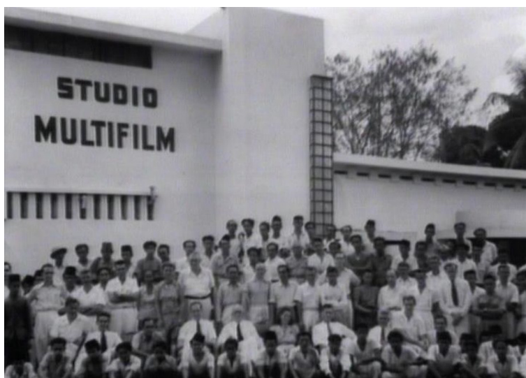
Photo 5. Studio Multifilm Batavia, ©Dutch Government Information Service.

The films produced during the years 1946–1949 come in a variety of forms, but for this paper the main focus is on the longer documentaries and newsreels. To start with the latter: in the Netherlands, Polygoon was the main and in fact only Dutch newsreel after the war, distributed in 110 copies every week around the country. News from Indonesia was a regular feature in Polygoon , but they did not have their own office in the colony. All their footage came from the Gouvernements Filmbedrijf. Polygoon took pride in being an independent company that used different news sources to make a story, but when it came to Indonesia, the sources were limited to one: the government. More film