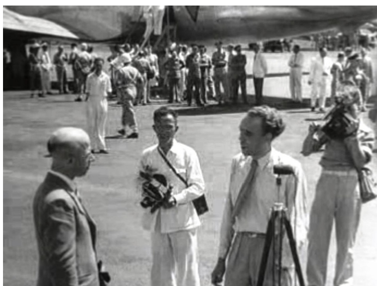
Photo 6. The arrival of Dutch PM Louis Beel at the airport Kemajoran in Batavia, where he is welcomed with the question: "Did you have a good trip, your excellency?" Go to the online version of this article to see the full video.

After the war, the government of the Dutch East Indies was the owner of all Dutch language media in Indonesia and people were well aware that this did not suit a democracy. In a policy document from 1946, this situation was described and condemned as inappropriate, but it also provided an explanation: because the war had destroyed all Dutch language media, the help of the government was needed to restore a proper media environment. And since rebuilding needed a 'new spirit,' it was deemed necessary that there would be, for the time being, a certain amount of government control over the media. 21 This 'for the time being' lasted until the moment of the transfer of sovereignty at the end of 1949. The minister of Finance regularly pushed for selling the film studio, as the cost of film production was very high and films never made any profit, but this was never realized. Lieutenant governor-general Van Mook prevented it,