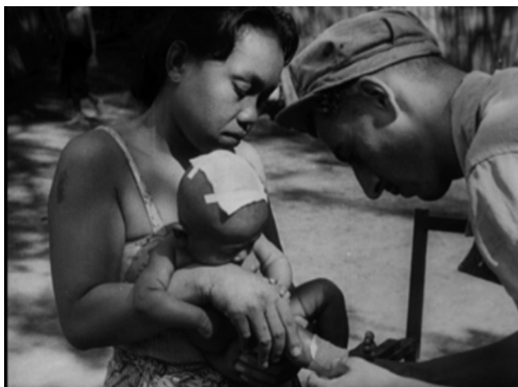
Photo 9. Still from an episode of Soldier Overseas (1948), in which a medical orderly helps local people. Go to the online version of this article to see the full video.

The accusations broadcast in Achter het Nieuws in January 1969 had some follow-up, but it took several years for television to pay attention again to what had happened in post-war Indonesia. The much-publicized and filmed state visit of Queen Juliana to the former colony (the first time ever the Dutch crown paid a visit) in 1971 was apparently not seen as an occasion to open old wounds. Neither television broadcasts nor movie newsreels mentioned war atrocities that had taken place in the past. But at the end of 1976, a three-hour long documentary was broadcast under the title