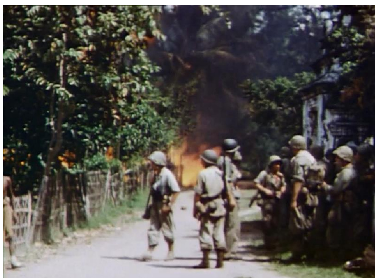
Photo 12. Brigadeflitsen , footage shot in 1946 by the Marine Information Service. Go to the online version of this article to see the full video.