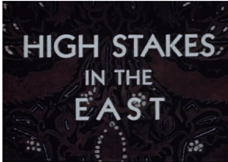
Photo 2. Title sequence from High Stakes in the East , 1942. Go to the online version of this article to see the full video.

got an Oscar nomination, and Peoples of the Indies . These were so-called short films, each lasting ten minutes, with a voice-over that was clearly aimed at American audiences. 15