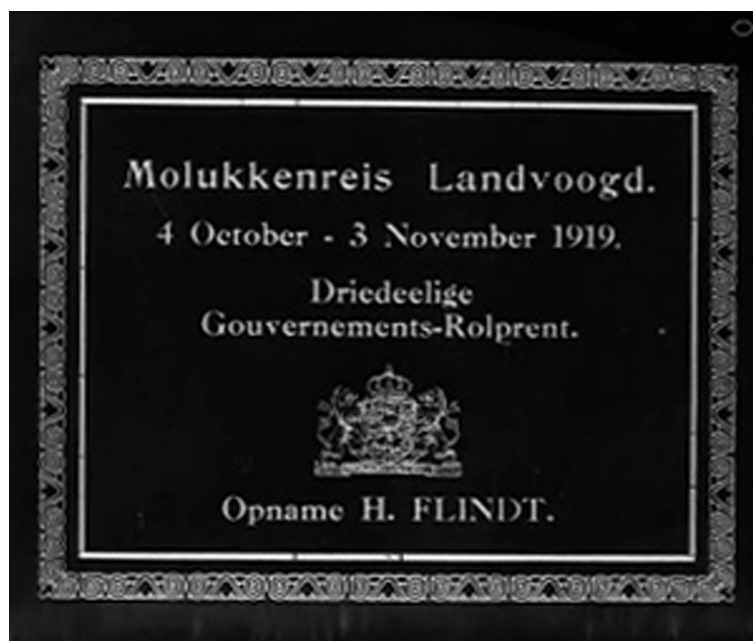
Photo 1. Title sequence from The arrival of governor-general Van Limburg Stirum in the Moluccas , 1919. Go to the online version of this article to see the full video.