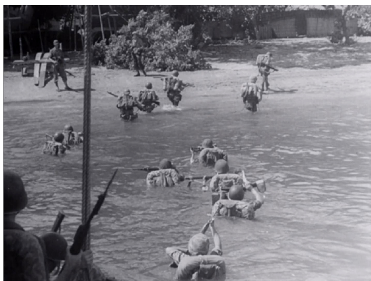
Photo 11. The landing of the marines at Pasir Putih, part of a longer movie newsreel about the Dutch military operation in the summer of 1947. Go to the online version of this article to see the full video.

It is telling that De excessen van Rawagedeh , the documentary that had far-reaching consequences for the policy of the Netherlands regarding war crimes in Indonesia, did not use archival footage. Even with re-editing the original government films, it is hard to convince today's audiences that this colonial war was one of guerrilla warfare and atrocities. The message that the films once were meant to give, lingers on. This becomes clear as one reflects on one of the more 'popular' sequences from these days: the landing of the marines at Pasir Putih, a stronghold on the coast of East Java, at the start of the military push in the summer of 1947. 34 The sequence originates from a long Polygoon report on this offensive and is often used in television programmes, as the start of a historical overview of what happened ( Achter het Nieuws also started with these shots).