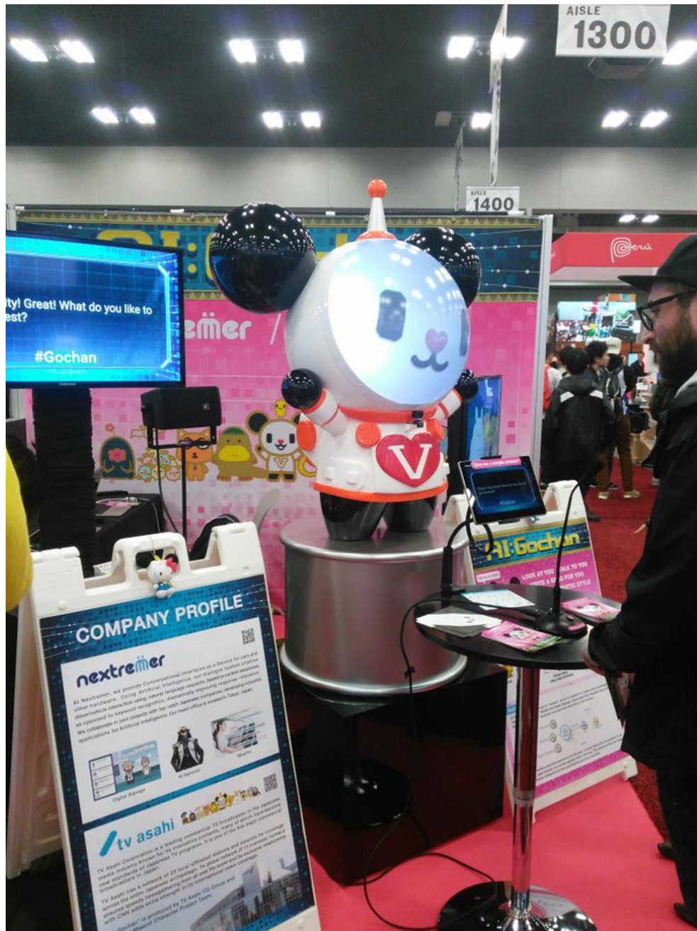
Fig. 1: Gō-chan at SXSW

multiple narratives—or even altogether outside of them. Their purpose is to raise a specific form of desire with their fans, also known as ›moe‹, which is triggered by their aesthetic appeal and recognizable tropes, such as their cuteness or their glasses (cf. AZUMA 2009; GALBRAITH 2009). Gō-chan is such an icon—simplistic in character design, with large cute eyes and a big head (cf. fig. 1).