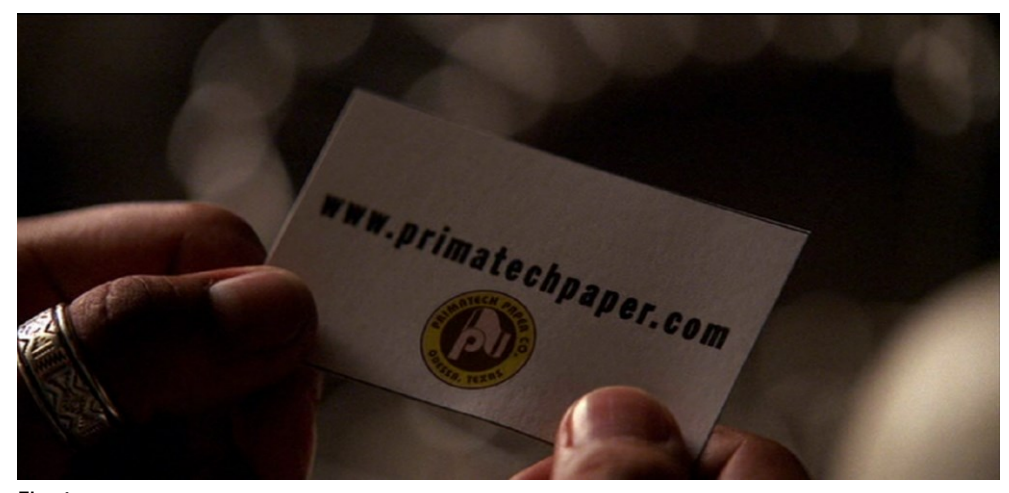
Fig. 1: Screenshot of business card close up from Heroes S01E12 (»Godsend«)

(see fig. 1). At this point of the TV narrative, the audience already knows the name of Bennet's company—the only reason for this invitational close-up is for people to go online and try out the web address. This is even more evident given that we never see Mohinder actually visit the homepage. Christy Dena understands this scene as a »catalytic allusion«, which »can have two functions: they can simply operate normally as part of the non-interactive discourse, or they can succeed in being recognised and acted upon as a catalyst for action« (DENA 2009: 310). Assuming the allusion worked and the audience followed the invitation, they found a homepage that let them browse through company information, etc. It was very reduced in style as well as information and the design looked outdated for 2007.