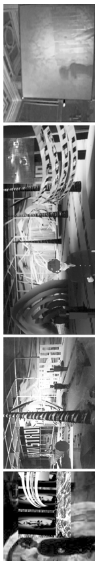
Fig. 1. Home of the Brain – VR Installation (1991)

Virtual Reality evolved from mechanical simulators for the training of combat pilots in the Second World War and computer graphics research in the early 60s. “Virtual Art” 9 , based on Virtual Reality (VR), the making of interactive environments, had nearly no resources in the traditional art world to have recourse to. In “The Ultimate Display”, computer scientist Ivan Sutherland (1965) published the theoretical foundations for VR: “The ultimate display would, of course, be a room within which the computer can control the existence of matter. A chair