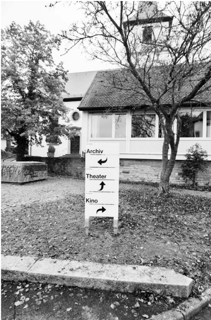
Figure 2: 'The Theatre'

versions of grand machineries of narration in the countryside. The audience travels to the village from all over the place and observes the village's communal structures and everyday practices as art. In these processes, new interdependencies emerge between town and countryside and between invented and existing infrastructures.