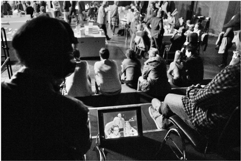
Figure 5: 'The Audience'