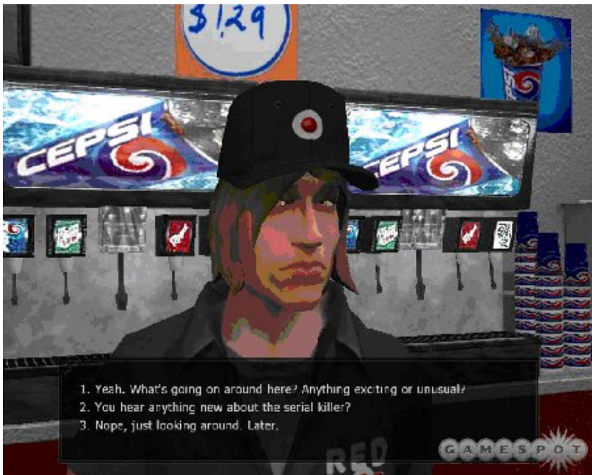
Fig. 5: The dialogue in this screenshot provides three choices, yet it is clear that one (choice 3) only leads to stasis and does not advance the plot. (Activision 2004).

In the image below (Fig. 5), it is clear that the answer 'Nope, just looking around. Later.' is relatively pointless. The other two questions appear on closer inspection to be different variations of the same thing. By asking either, the player will ultimately be led to the same answers, which means any agency granted here is ultimately illusory.