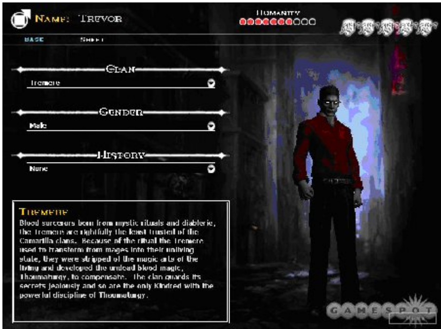
Fig. 4: Character creation screen, VtMB 3

Player reading of clan choices will vary greatly. To those new to the setting, the choice of clan will be dictated by what is presented in the game itself, a short description of the clan and the associated avatar (Fig. 4). All the clan choices affect the dialogue options available when talking to characters in the game but, for the most part, these options make very little real difference to the game's outcome. Once again this is symptomatic of the illusion of agency the game creates.