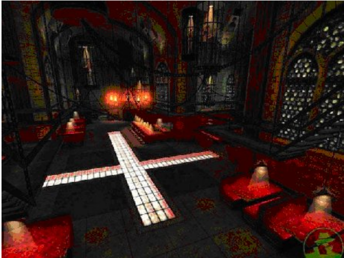
Fig. 2: A church that has been converted into a nightclub. (Activision 2004. Reproduced with permission)

Thus we see elements of different media and mythology combining to form the heart of a transmedial world: