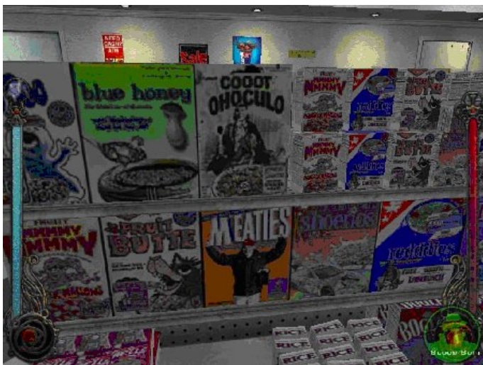
Fig 1: Supermarket shelves in VtMB . (Activision 2004. Reproduced with permission)

Vampire mythology contributes strongly to the mis-en-scene of VtMB but the game world also evokes the nihilism of gothic-punk, blending it with our knowledge of the present day. These three aspects are combined or juxtaposed to create new cultural artefacts within VtMB , by using the mundane contents of our world in the usual ways (Fig. 1), by juxtaposing them to create the ambience of the World of Darkness or by inserting the fantastic into recognisable settings. In Figure 2, moral decay and the descent into sensuality are depicted by the inversion of church into nightclub. The light well in the centre of the image places the church’s cross below the congregation rather than above, transforming a traditionally holy symbol into something that suggests deviance and perversion. Similarly, the myth that vampires cannot enter churches is debunked here.