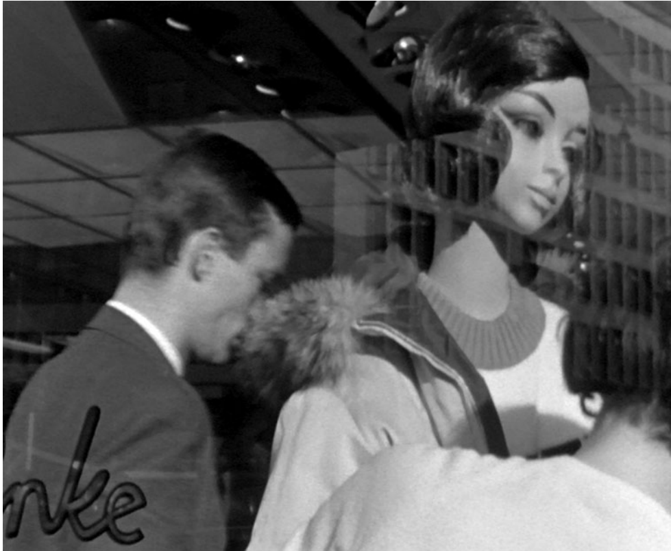
Still 14. Stad zonder hart (1966).

Rotterdam also suggests that, even though films may bend to either memory or oscillation, the functions remain intertwined. Memory also enables oscillation: found footage allows for juxtaposition of images, moving between perspectives, while it can also be used in different ways, from which new narrative lines are drawn. Oscillation in turn, creating perspectives for the future, also implies a new understanding of the past. This dynamic relationship between these cognitive functions fulfilled by moving images, is a characteristic of the city as an adaptive system . This is a modification of Luhmann's view, yet it also strengthens his claim that through these functions the notion of time itself is constructed.