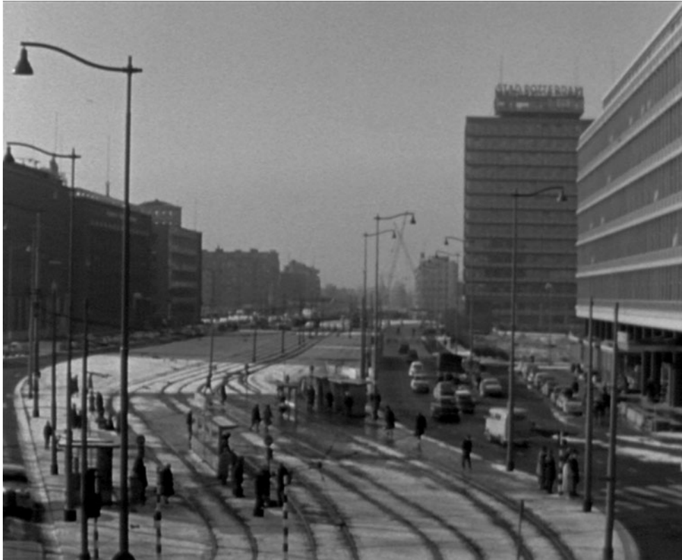
Still 11. Stad zonder hart (1966).

copy of En toch... (1950), from which he took the UFA footage, i.e., the German recordings of the bombardment that had been used in that film and re-appropriated Von Bary's films (Stills 13-14), even without knowing Von Bary's original work. Schaper's Stad zonder hart articulated the dynamic of the old city again, while criticizing the modern planning practice of separating spatial functions. Inserting historical footage, literally cut out from a film that had promoted the new city, meant a reappropriation of the city's memory through film. Using the historical footage to match it with the recorded results of the reconstruction, the film provided feedback for the city to move into another direction. Not unlike En toch... , which moved back and forth in time, this documentary was also a matter of oscillation, yet drawing different perspectives.