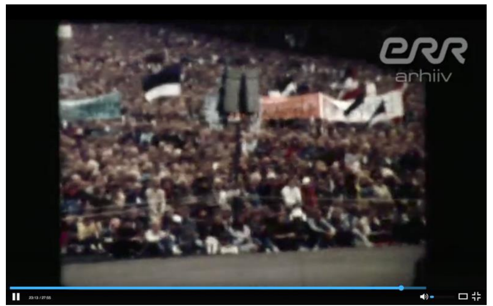
Figure 3. Song Festival 1988, in: 8 MM Life, 1/2015

The series categorized the films thematically and included clips of diverse activities in each episode. There were moments of escaping the everyday and events with a national undertone, e.g. Estonia's struggles to regain its independence and maintain its Estonianness. Some footage shows emblematic events from the late 1980s, such as the Song Festivals and the flying of the national flag in public.