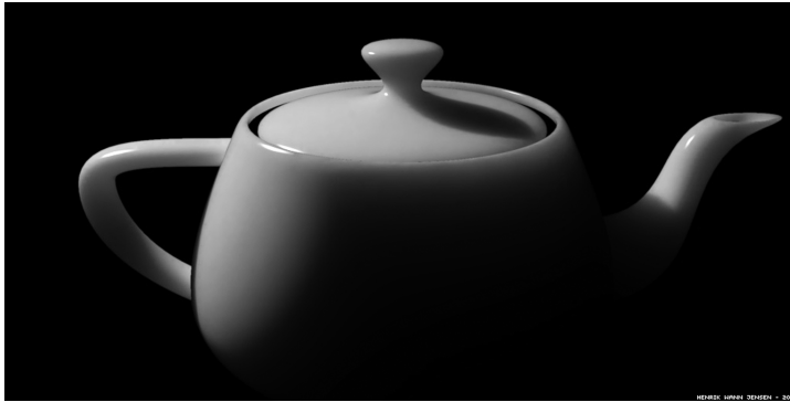
Fig. 1: Hendrik Wann Jensen, Utah Teapot rendered with BSSRDF, 2002.

oped in relation to different theoretical concepts of materiality. Before approaching the matter however, the stigma of immateriality still clinging to computer generated imagery, needs to be explored briefly.