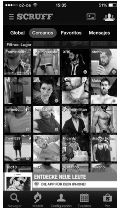
User profiles on Scruff , in Providencia, Santiago de Chile.

I sent a good number of messages on Scruff , but I did not have much success. When I typed in “Providencia, Santiago de Chile,”—my former neighborhood in Santiago—45 profiles out of 100 appeared semi-nude. Of course, as researcher, that was not the case with my own profile. In general, the photos were more suggestive than mine. Particularly in this app, the photo seems to be everything.