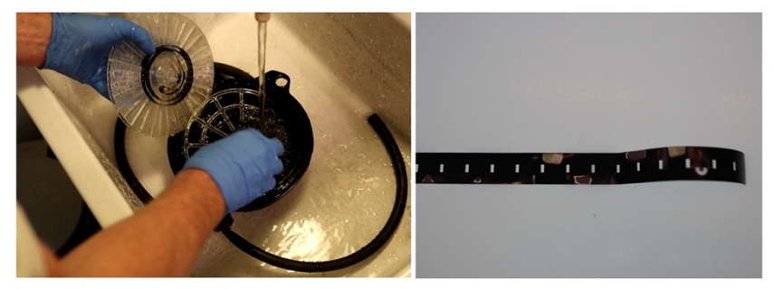
Fig. 6: Lomo tank and 9.5mm film development in action in the film lab.

In total, two recordings were made to test if any imagery was captured on the expired 9.5mm film. In the first test, the exposed frames were cut out of the cassette in the dark room and developed by means of the standard development procedure, reduced to taking four minutes in the development bath. Unfortunately, it resulted in a black negative film strip, showing no exposed images at all. In the second attempt, an even shorter development time – 2 minutes and 30 seconds – was used, but no results appeared either.