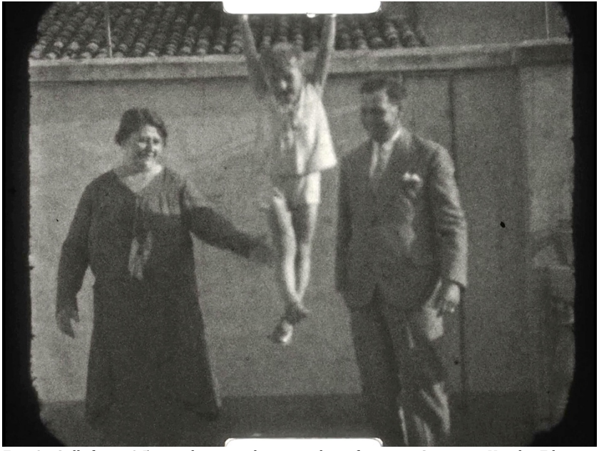
Fig. 2: Still from 9.5mm showing the central perforation.

economical use of film, a disadvantage of the central perforation is that the film is less stable in terms of transport, risking the occurrence of torn film. For recording, 9.5mm film came in a cassette or 'charger', so users only had to insert the cassette into the camera to start recording. Besides ease of use, another advantage of the cassette was that it could be charged in daylight. A standard reel of 25 feet of film corresponds to approximately 1000 frames, 'which suffices for, roughly, one minute of "action".[30] For screening, the 9.5mm film came in the shape of a metal cassette or spool, called bobines in French, originally holding 30 feet of film. After 1925, 60 feet and 300 feet reels were released in order to extend the film's running time.