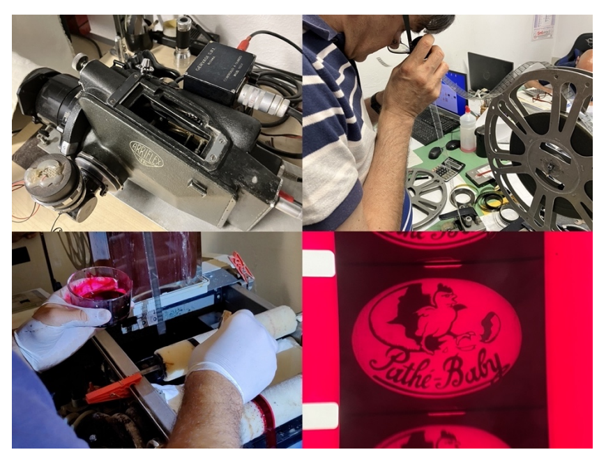
Fig. 9: Conversion and colouring process of the 'new' Barzizza film print.

light, almost invisible after the final rinse. So it was decided to increase the concentration of the dye, spreading it with a brush directly on the emulsion, after dipping the film in an acidifying solution that allows the gelatine to be prepared for absorption. The new test done on a few centimetres of additional triacetate print was definitely encouraging, even the mix of dyes used seemed to adequately simulate the colour visible on the film scan file. A continuously modified developer was used to process the approximately fifteen metres of the film to be coloured. Upon exiting the wet part, the film was dried and rewound. The result was better this time: the colour was homogeneous and bright. The reel was then re-assembled by joining it at the head of the 16mm duplicate.