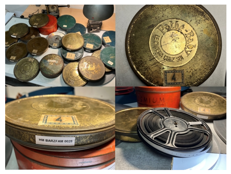
Fig. 7: The Barzizza family collection.