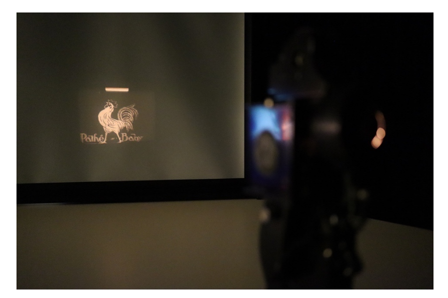
Fig. 5: Screening a film with the Pathé Baby projector.

The Pathé Baby projectors were subsequently used to explore some of the distinguishing features described in the previous part, in particular the notch function, speed of rotation, and the projector's flywheel-shutter combination; and to practise some of the more general technological processes, including manually setting the focus, positioning the image within the frame, and determining the brightness and size of the image on the projection screen. The 'thinkering' experiments also enabled the comparison between the hand-cranked and motor-driven version in use, identifying both their affordances and constraints. The hand-cranked Pathé Baby, for instance, not only provided a greater control over the speed of rotation, but also differed from the motor-driven version in the sense that it allowed for rotating the reel backwards, making the images run in reverse. The experiments furthermore made explicit the functionality of the aforementioned notch: pausing the film from running through the gate during the projection of the title frames. In the case of the hand-cranked projector, turning the crank felt much lighter compared to the regular cranking movement. This made the experimenter not only experience the notch function itself, for instance by hearing the very noticeable clicking sound of the bar release after every turn, but also sense how the notch is connected to the projector's internal mechanism.