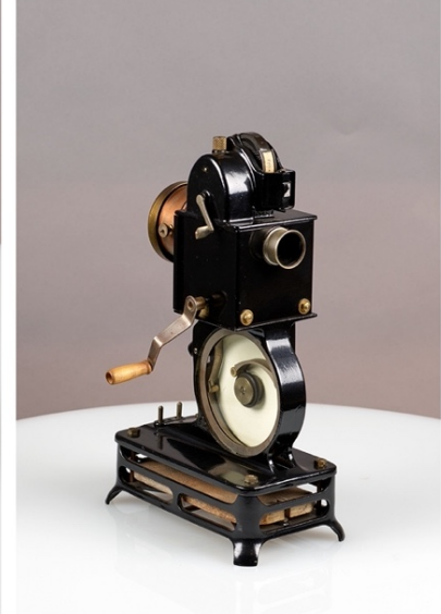
Fig. 3: Pathé Baby camera and projector.[44]