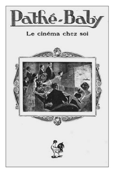
Fig. 1: Advertisements from the 1920s, depicting home cinema screenings with the Pathé Baby projector.