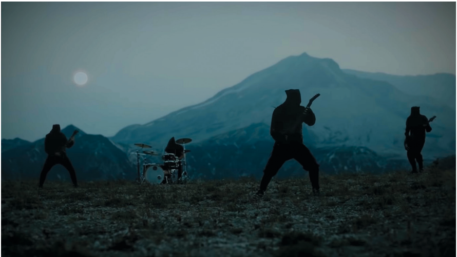
Fig. 6: Music video still from CULT OF A DYING SUN, Uada, 00:03:20.

be interpreted as anti-modern in two ways: modernity is associated with urbanization, mechanization and rationalization, while the turning away from modernity is associated with nature, myth and irrationality. 58 The reference to nature is also anti-modern when it arises from the connection between nature and paganism, specifically with the claim of (pre-modern, pre-Christian) originality. This claim is also fed by the Romantic conception of nature. 59 There is no industrialized landscape in Romantic-era Kunstreligion