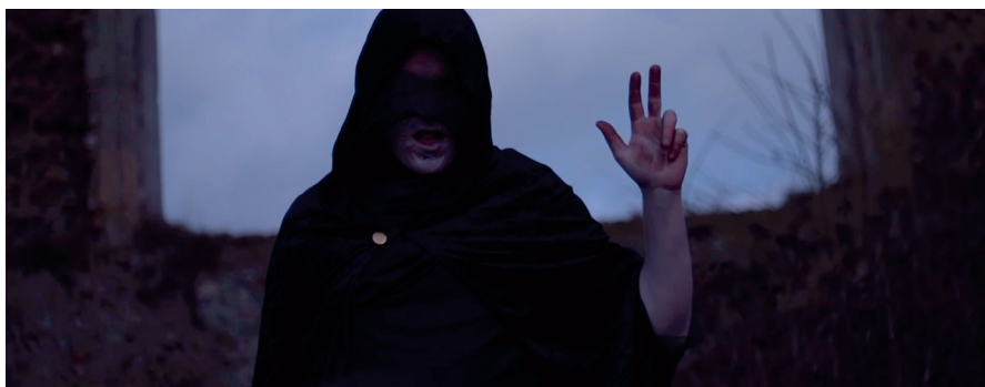
Fig. 3: Music video still from ASURA's REALM, Venom Prison, 00:00:42.