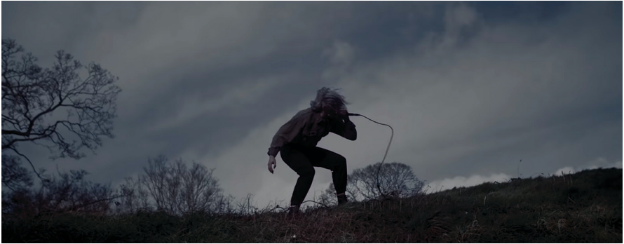
Fig. 5: Music video still from ASURA's REALM, Venom Prison, 00:01:39.