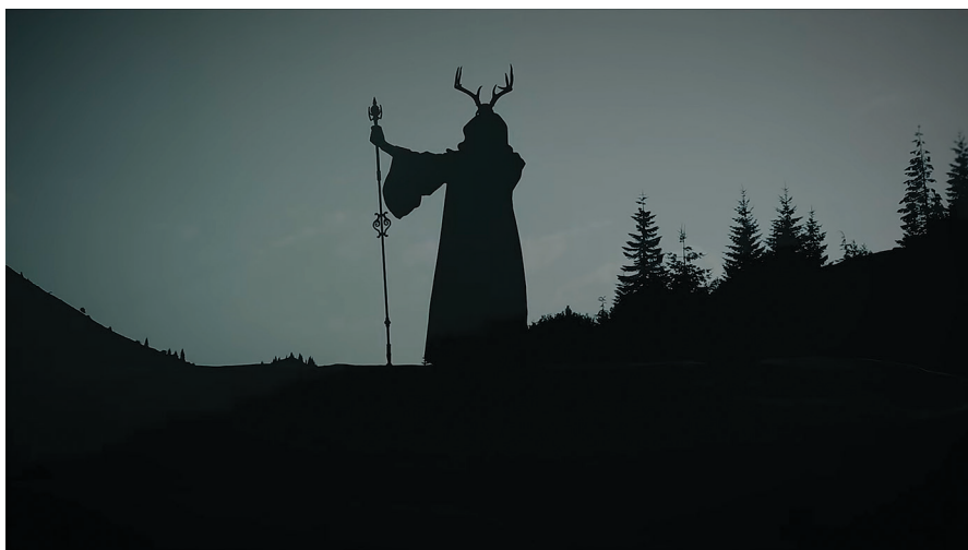
Fig. 4: Music video still from CULT OF A DYING SUN, Uada, 00:02:49.

from guilt or consequences. A connection can be made between the idea of religion as oppressive and social systemic compulsion, with the motif of a priest-like cultic figure framed to accentuate authority. Beyond the visual support, the lyrics provide an allegorical reading of corrupt authority. Contrastingly, the priest figure in Uada's video is the sacrificing participant and enacts violence through the implied burning of the child (the bundle). The narrative of sacrifice turns into a "deal with the devil". The video description 57 names the figures as Mother/Ritualist and Djinn/Ritualist. Although