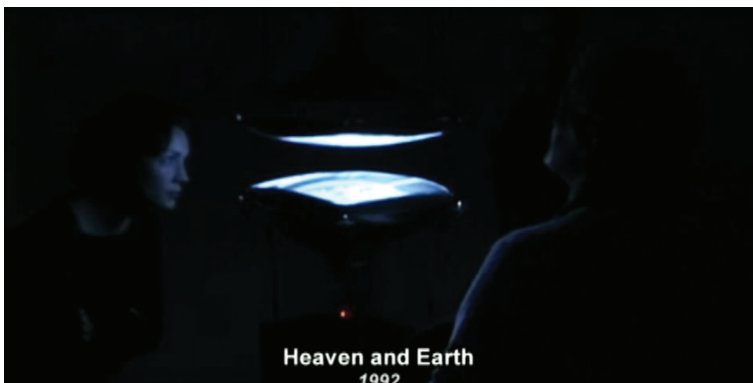
Video 3. Heaven and Earth, 1992, G. Marsh, 6 February 2017.

Later, New York-born artist, Bill Viola (1951) used video art to explore birth, death and aspects of consciousness by denaturalising the TV monitor. Viola's installations have been displayed not only in leading museums and galleries such as Tokyo's Mori Art Museum but also in aberrant situations such as a giant screen suspended over the orchestra at an opera in New York's Lincoln Centre and in the nave of England's medieval Durham Cathedral. Having grown up with television, Viola states: "For me, it was like going into the belly of the beast. One of the jobs of being an artist is to detoxify things." His work, Heaven and Earth (Museum of Contemporary Art San Diego, 1992) encompasses television monitors with exposed cathode ray tubes whose glass screens face one another. Reflecting their images into one another, they show how birth and death are suffused.