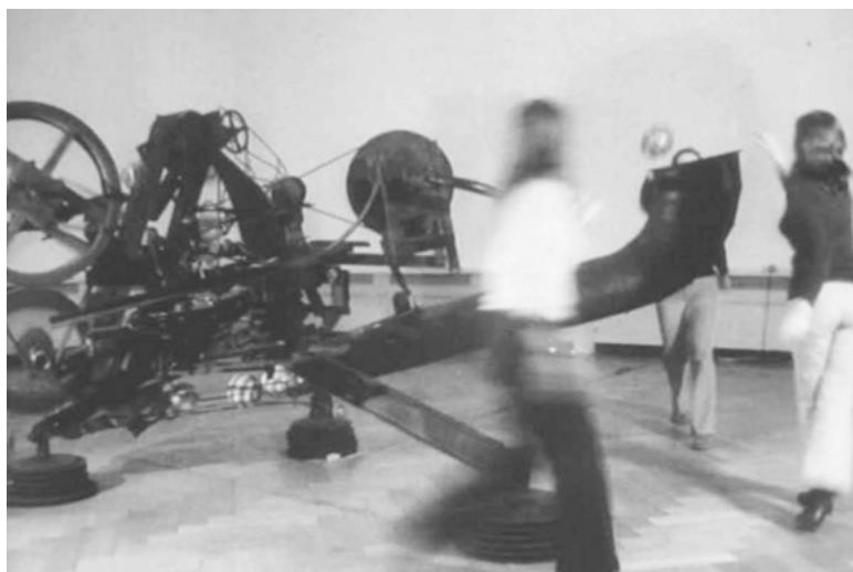
Fig. 8: Exhibition Jean Tinguely, Kunsthalle Basel, SCHWEIZER FILMWOCHENSCHAU, no. 1497, 25 February 1972.