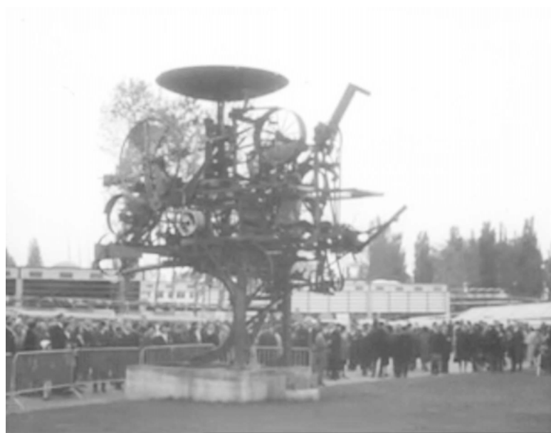
Fig. 9: Jean Tinguely, Heureka, National Exhibition Expo 64, Lausanne.

ture near the rollercoaster and hence reinforces an association between the two.