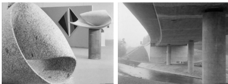
Fig. 1 & 2: Kunsthaus Zurich, Exhibition Max Bill, SCHWEIZER FILMWOCHENSCHAU, no. 1339.2, 13 December 1968 (left); Highway N1, Zurich-Winterthur, SCHWEIZER FILMWOCHENSCHAU, no. 1339.1, 13 December 1968. (right).

presented as an analogy to the “good form” of highway construction (see Figs. 1 and 2).