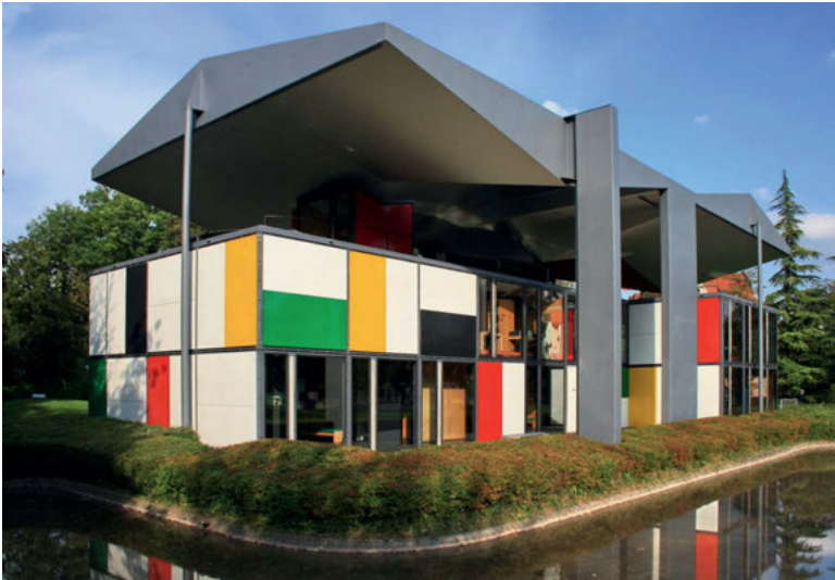
Fig. 7: Le Corbusier, Centre Le Corbusier, Zurich, 1967.

“grand récit” of Switzerland as an esthetic-ethical construct informed by a functional esthetics. This “grand récit” combined innovation in engineering and construction with great novelty in architectural and artistic conceptualizations. Therefore, it is not surprising that the last house designed by Le Corbusier, the Centre Le Corbusier in Zurich, got full coverage by both newsreel and television (see Fig. 7).