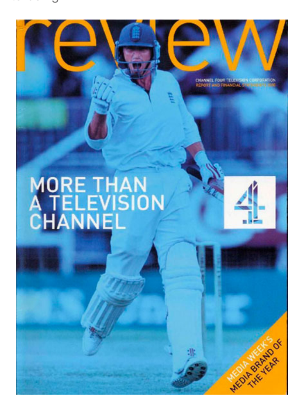
Fig. 1 Front cover of C4 2000 Annual report. Its tagline reads 'More than a Television Channel.'

a strategy to secure its finances and fulfil its challenging remit. Spearheaded by a dynamic Chief Executive in Michael Jackson, the Channel 4 Television Corporation (C4) expanded into various media-related businesses. It wanted to become, as the 2000 Annual Report boldly stated, 'More than a Television Channel.' In other words, the channel intended to become an all-purpose, convergence-friendly multimedia operation. C4 apparatchiks posited the spending during this period as a necessary investment to secure the broadcaster's future in a digital marketplace, but most of it provided neither the financial sustenance to keep C4 buoyant nor the prestigious or socially useful content a public service broadcaster should bring into being.