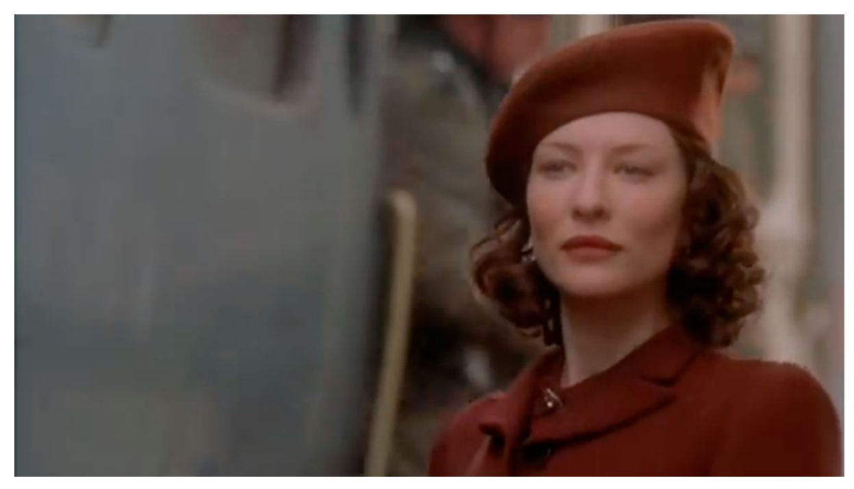
Video 1. Click here to watch it. Cate Blanchett's face is emphasised as the primary selling point of Charlotte Gray (FilmFour/Warner Brothers, 2002)

Pursuing the commercial market meant creative compromises, which weakened the films, which were often glossy but depthless. The best example is the film most frequently cited as the cause of FilmFour's eventual demise, Charlotte Gray (Gillian Armstrong, 2001). With a budget upwards of £15 million, it was the most expensive independent film ever made in Britain. Its North American distributors, Warner Brothers unwisely opted for a December opening, hoping that this would produce the awards nominations that were increasingly central to marketing prestige dramas. Awards committees were not convinced, even by the acting of the usually admired Cate Blanchett in the lead role. As the preponderance of close ups of Blanchett in the trailer for the film demonstrates, it was sold to audiences on her star persona of outstanding acting talent and beauty.