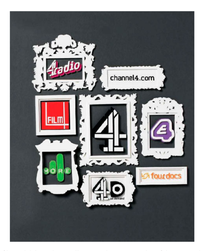
Fig. 3 This page from the 2006 Channel 4 Annual report illustrates the segmentation of the corporation into convergent media outlets

Emphases and absences in annual reports are particularly telling. FilmFour Ltd. is conspicuously absent from the 2002 report, the year in which it had been drastically cut back. However, where this document spends several pages explaining the meaning of multi-channel television to justify C4's convergence strategy, in 2003 and particularly 2004, the focus is on the public service remit of the core (terrestrial) channel, with FilmFour and the other non-television services downplayed. The year 2005 continues to stress public service, but begins to apply it to the entire C4 portfolio, describing its newly launched digital More4 service 'a public service channel for the 21<sup>st</sup> century'. By 2006, C4 was envisaged as a convergent television brand, with the chairman's statement illustrated with an image of the diverse media outlets under the broadcaster's auspices.