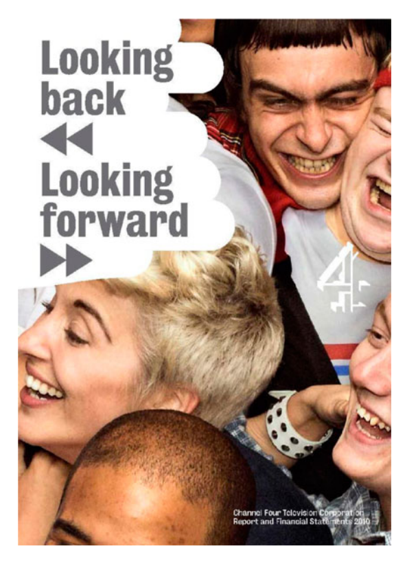
Fig. 4 The front cover of the 2010 C4 Annual Report uses This is England '86 , a programme, which demonstrates the convergence between cinema and television, to show its commitment to the traditions and future of the corporation.

C4's attempts to become a broader-based media corporation suffered from a lack of capitalisation, dependence on an unpredictable and depleting means of finance in advertising, and, ultimately, a lack of genuine vision about how a small television broadcaster might play to its strengths. 2013's 'Born Risky' advertising campaign suggests that these strengths historically were innovation and experiment. Channel 4's ability to do this in future, under pressure from mounting competition and an unsteady financial basis, is likely to be limited.