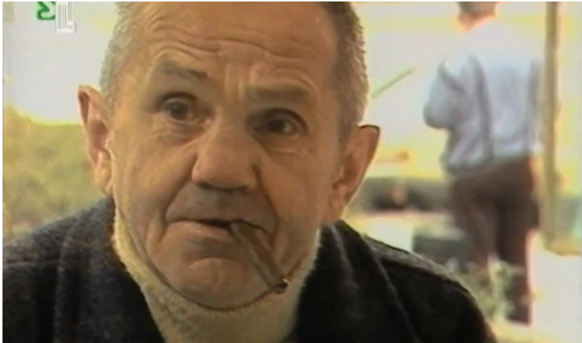
Video 5. “The West as a Test.”

R. Steinmetz and J. Kretschmar, The Great Transformation in Germany of 1989/90 from the View of Local Television (1990–1995)