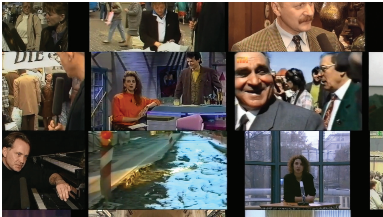
Video 2. Video statement of the researchers.

“view from below,” from East German people in rural as well as metropolitan areas - unique historical sources for the cultural memory of one of the most important historical cuts in the 20th century.