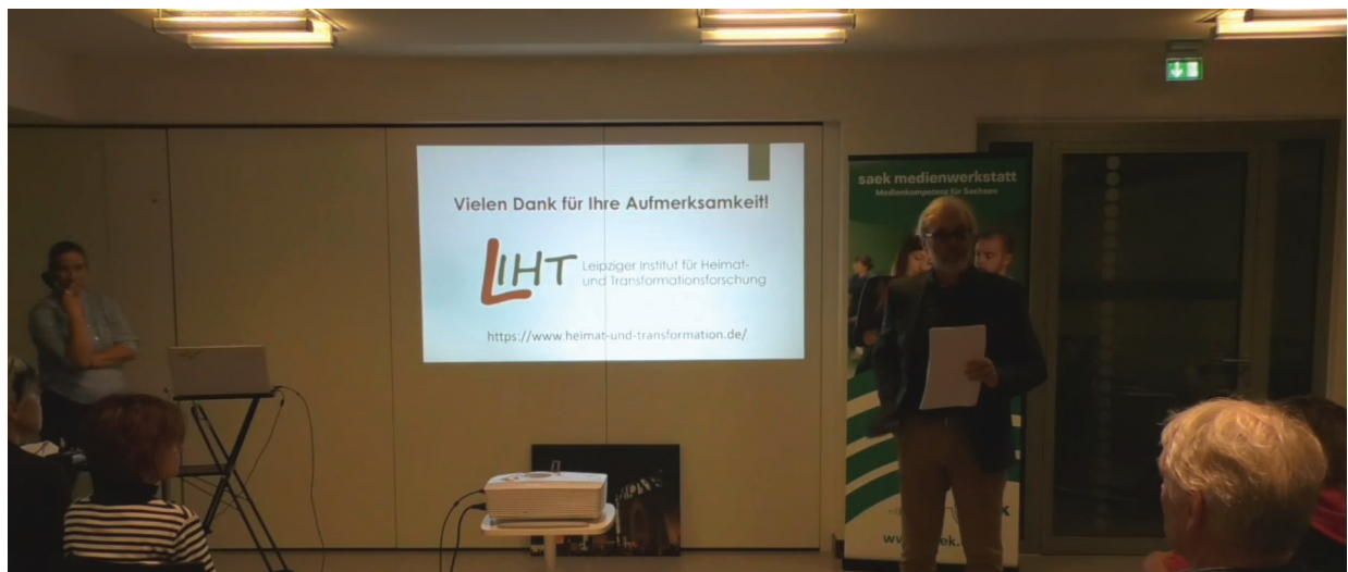
Video 6. Statements in focus group discussions.