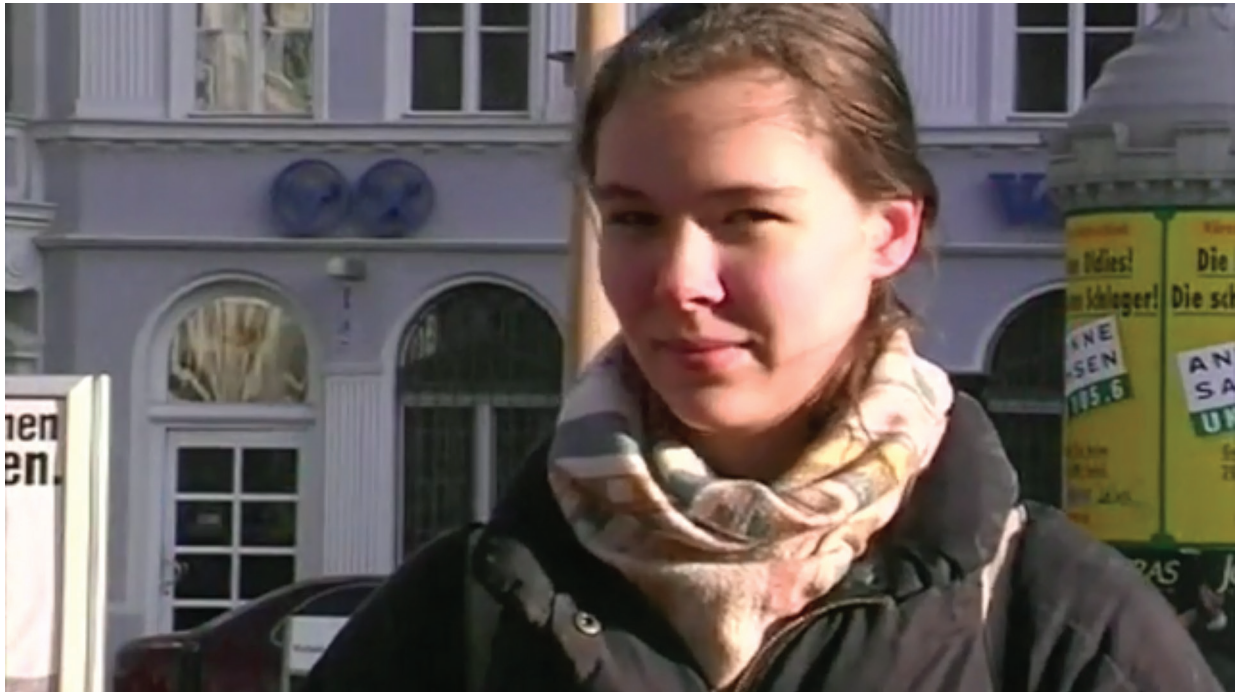
Video 1. Youth and politics.

The process of unifying Germany and Europe began with the fall of the Berlin Wall and of the 1000-kilometer-long German-German border, five years before. And Görlitz is directly situated at the border to Poland, separated only by River Neisse and connected by a bridge.