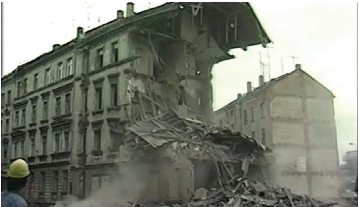
Video 4. Project trailer - Next door television. Saxon local television 1990 to 1995.