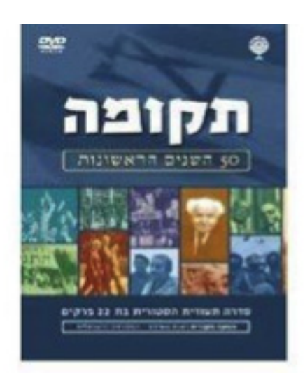
Fig. 1-2. Pillar of Fire and Revival front cover.

While Revival deals almost exclusively with events in Israel, Pillar of Fire dedicates a considerable part of its historic review to world events, particularly European. A central subject is Jewish existence in Europe. Jewish communities and way of life in Russia, Poland and Germany are described extensively, prior, during and right after the Holocaust. Major events in European history are described: the Russian 1905 and 1917 revolutions, Word War I and the Conventions that followed it, pre-Hitler Germany and his ascent to power, World War II and its major battles. Hundreds of film excerpts, the result of unprecedented, meticulous research projects in European archives, depict life in Europe in the last quarter of the 19<sup>th</sup> century and the first half of the 20<sup>th</sup>.