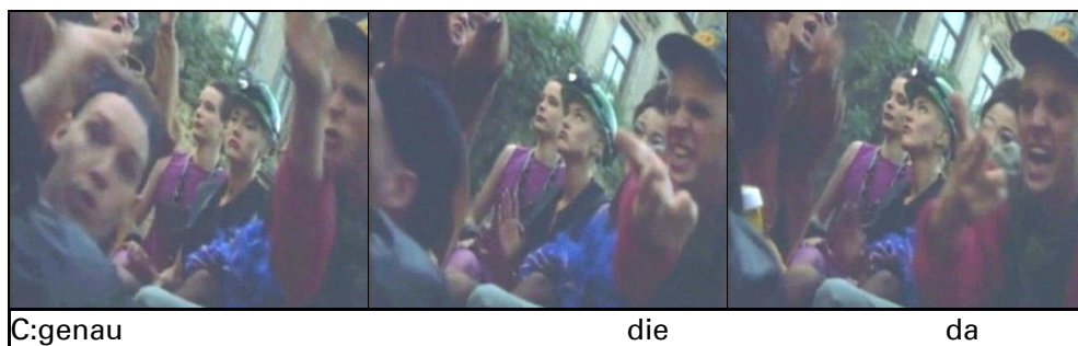
Fig. 5 4

In another image sequence (fig. 5), there is a special case illustrating the additional value of the camera perspective. The deictic clues (gaze and gesture) of the person in the right part of the picture are nearly referencing the center of the image.