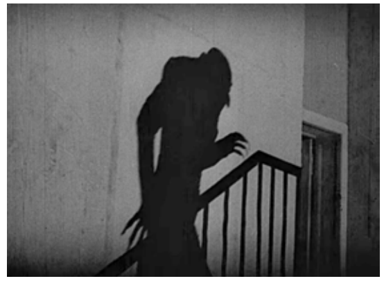
Film stills, BATMAN RETURNS (Tim Burton, US 1992), 01:03:10 (fig. 11, l.), 00:09:14 (fig. 12, l.), 01:16:55 (fig. 13, I.); CAT PEOPLE (Jacques Tourneur, US 1942), 00:21:26 (fig. 14); Nosferatu, eine Symphonie des Grauens (Friedrich Wilhelm Murnau, DE 1922), 01:28:19 (fig. 12); DRACULA (Tod Browning, US 1931), 00:10:21 (fig. 16).