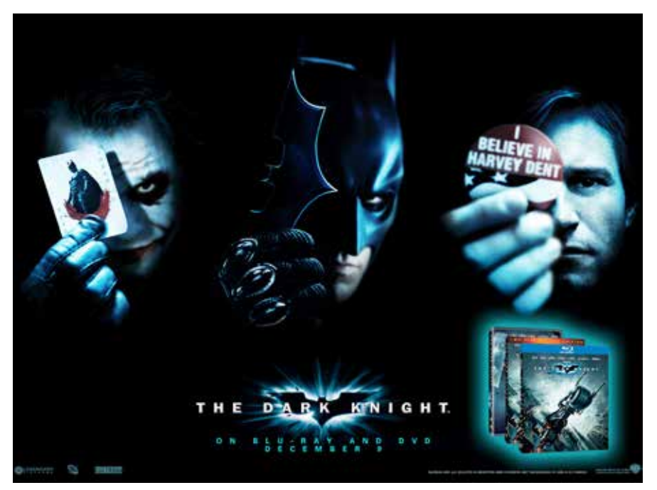
Fig. 21: This downloadable wallpaper from The DARK KNIGHT'S (2008) official website showcases the film's use of the face as an image of its underlying theme of duality. http://thedarkknight.warnerbros. com/dvdsite/media/images/downloads/TDK04 1600x1200.jpg [accessed 19 September 2016].

ture", Bruce Wayne declares at his fundraising party. 46 Dent is Gotham's shining white knight, a hero with a face that eventually could suspend the need for a masked Dark Knight. Behind this facade, however, lies a second face – Two-Face. Dent's flaw is his moral intransigency. In his monochrome worldview, good and evil are so widely separated that the self-righteous attorney cannot connect to his darker side, which erupts in occasional outbursts and acts of desperation. Dent's case alludes to the Strange Case of Dr Jekyll and Mr Hyde (1886), Robert Louis Stevenson's famous examination of human nature's duality. Like Jekyll, Dent tries at all costs to hide his evil other, because he does not recognize it as part of his own self. Therefore, all it takes is a "little push" from the Joker and Harvey's world is turned upside down. Deprived of the love of his life and left with serious physical and mental injuries, his moral bigotry is gruesomely written in his face in the figure of the Janus-like Two-Face. After his departure from good, the only consistent option left to him is to join with evil: "Either you die a hero or you live long enough to see yourself become the villain."47