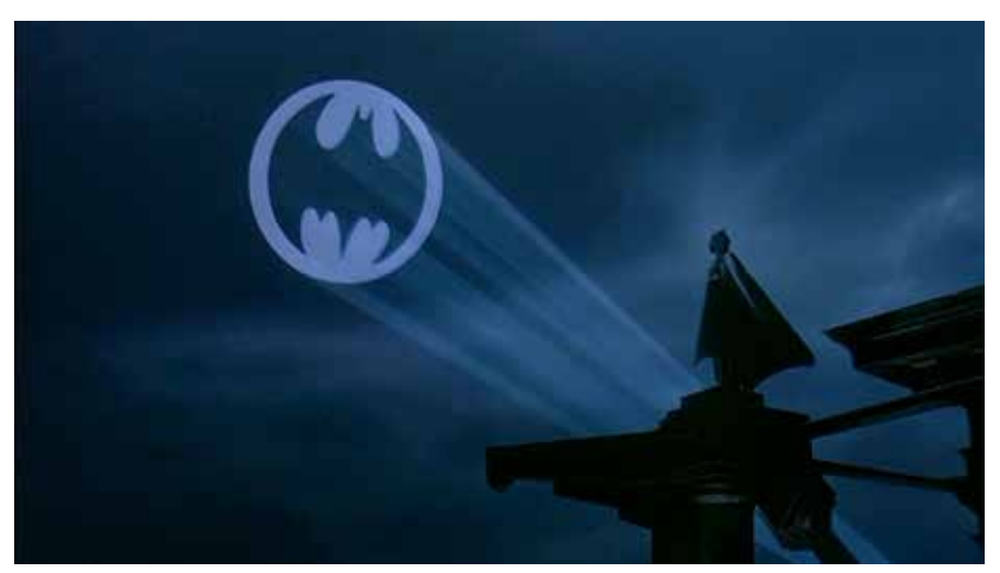
Fig. 1: Lives primarily in a world of darkness and shadows: Batman, Gotham City's iconic superhero. Film still, Batman (Tim Burton, US 1989), 01:57:21.

Joker [to Batman]: I think you and I are destined to do this forever.1