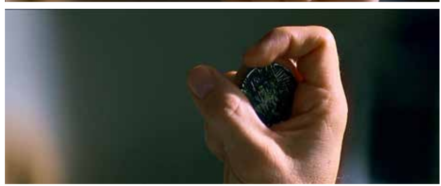
Figs. 22–27: Heads or tails – the dual philosophy of Harvey Dent/Two-Face is evident in his charred coin (figs. 22–24) as well as in his face (figs. 25–27, r.). Film stills, The DARK KNIGHT (Christopher Nolan, US 2008), 01:35:27 (fig. 22), 01:35:33 (fig. 23), 01:35:42 (fig. 24), 02:15:17 (fig. 25, r.), 02:15:58 (fig. 26, r.), 02:16:02 (fig. 27, r.).

The motif of the face turns into the image of a coin where everything has a reverse side (see fig. 22–27). Two-Face lost his faith in the right decision and his decision-making ability. Instead of being the master of his own destiny, he