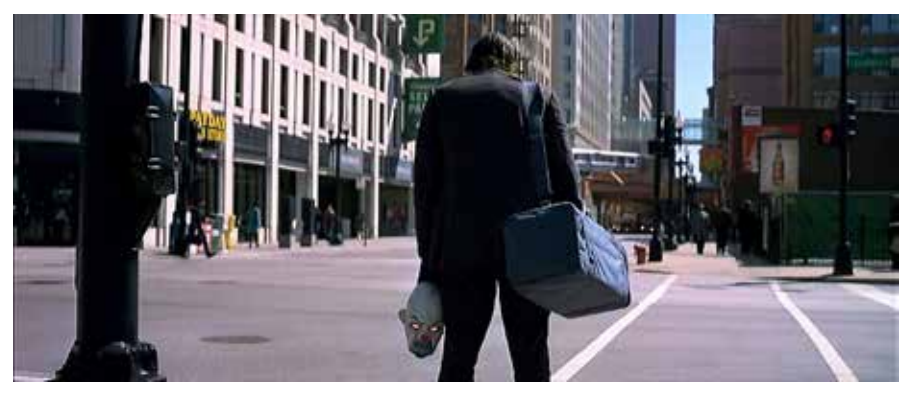
Fig. 18: A natural force of evil? In his first appearance, the Joker just stands on a street corner, seemingly materialized out of nothing. Film still, The DARK KNICHT (Christopher Nolan, US 2008), 00:01:17.

instead attests to the absence of one",<sup>35</sup> making him a being of pure theatricality, a displayed sign of a sign (see fig. 18).<sup>36</sup>