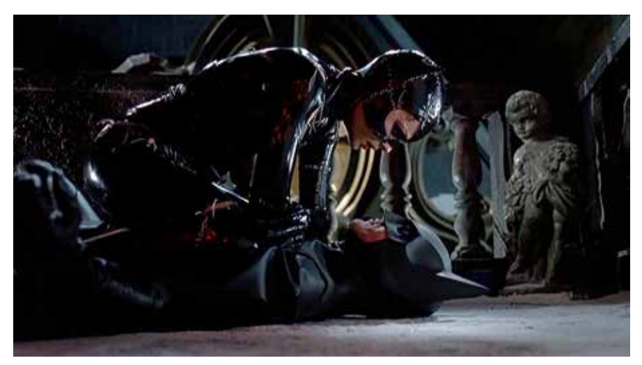
Figs. 9-10: An embrace of mask and identity: at night, they fight as Batman and Catwoman (fig. 9); in the day, they meet as lovers Bruce Wayne and Selina Kyle (fig. 10). Film stills, BATMAN RETURNS (Tim Burton, US 1992), 01:15:49 (fig. 9), 01:31:59 (fig. 10).