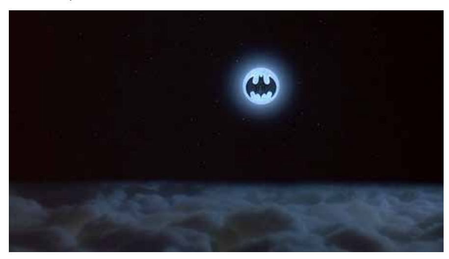
Fig. 2: Mise-en-abyme: although battling the Joker in the final showdown of film, Batman still finds the time to pose with his Bat-plane in front of the moon, displaying the Bat logo as his intradiegetic and extradiegetic brand. Film still, Batman (Tim Burton, US 1989), 01:39:16.

disclose and willingly subvert the clear-cut dichotomy in favor of a more complex and sophisticated viewpoint, as is the case with the Batman movies of Tim Burton and Christopher Nolan. Their visions of the Caped Crusader are unique, yet not completely out of line with the character. Instead, they ingeniously condense Batman's conflicting history into a multi-layered psychologization. In his many incarnations, Batman blurs the line between black and white, and unlike any other classic comic book superhero he constructs a world of multitudinous grey. Long before the postmodern hero deconstructions found in graphic novels like Alan Moore's Watchmen (US 1986–87), he had already been conceived in his original draft as an alteration and revision to the superhero myth. The Dark Knight is driven by his dual nature. In order to defend the light, he utilizes his darkness to fight evil (see fig. 1). Additionally, his fragmented textual existence self-consciously reflects his symbolic nature, unveiling the fictionality and theatricality of his character.