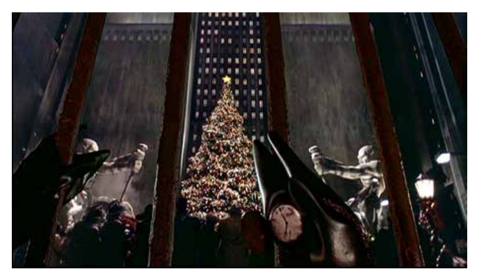
Figs. 4-5: The view of the outcast: the Penguin watches the Christmas charade on Gotham Plaza (fig. 4) from his underground world and executes his revenge on the society that expelled him on Christmas Eve as a child (fig. 5). Film stills, BATMAN RETURNS (Tim Burton, US 1992), 00:11:04, 01:34:51.