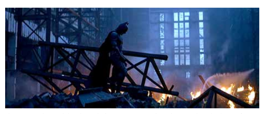
Fig. 17: Ground zero: Christopher Nolan's The DARK KNIGHT (2008) constantly evokes images from the traumatic terror attacks of 11 September 2001. Film still, The DARK KNIGHT (Christopher Nolan, US 2008), 01:33:06.

Burton's Batman vision is dark, fatalistic, oppressive. The Dark Knight loves his shadowy existence so much that he refuses to stand in the light of attention. The proactive villains take over and marginalize the hero in his own movie. By contrast, in BATMAN BEGINS (2005) Christopher Nolan resets the Caped Crusader as the main protagonist of the story and explores the beginnings of the char-