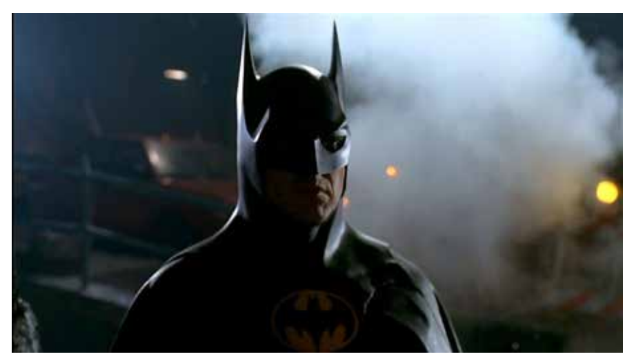
Fig. 28: Batman's shadowy appearance marks him as liminal character who inhabits a space between light and darkness, justice and anarchy, good and evil. Film still, BATMAN RETURNS (Tim Burton, US 1992), 00:55:37.

or the fight between order and chaos, justice and vengeance, rule and exception (THE DARK KNIGHT, 2008). What image could be more suitable, then, to illustrate these antagonisms than the shadowy figure of Batman, the very representation of duality itself? His whole nature as bat-man, as semi-entity, symbolizes the permeability of boundaries as he unites hero and villain, light and darkness, man and beast, idea and matter (see fig. 28). Among his clownish foes and circus counterparts, Batman is the true embodiment of the trickster archetype. He shifts between worlds, defies clear categories and signifies ambivalence. His multiplicity attracts artists like Burton and Nolan, who can express their individual vision through the versatility of his image.