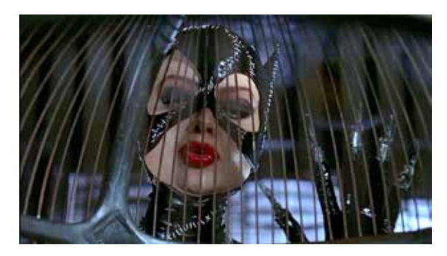
Figs. 11–16: Burton's postmodern cabinet of monsters and their classic role models:

human Max Shreck, who behind a façade of normalcy manipulates, corrupts and kills. As for the other freaks and monsters, Burton sees them not as villains, but as victimized individuals.<sup>32</sup> He breaks through the common association of disability with evil in fiction,<sup>33</sup> as his variation on the Obsessive Avenger–stereotype, a