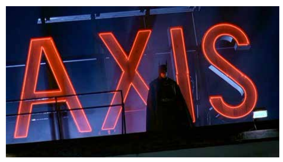
Fig. 8: Batman watches over Gotham City using questionable means. Film still, ВатмаN (Tim Burton, US 1989), 00:28:54.

surveillance state.<sup>27</sup> This sinister interpretation does not move far from Frank Miller's version of the Dark Knight.