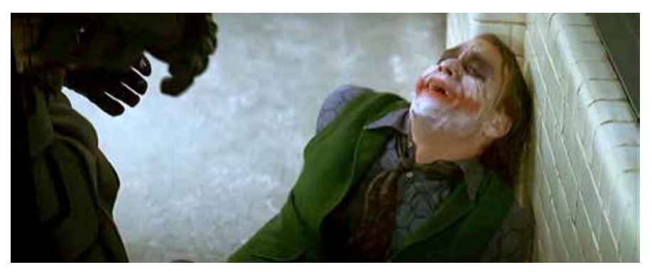
Fig. 19: Perfidious power game: even when in the ungentle grip of Batman, the Joker retains the upper hand. Film still, THE DARK KNIGHT (Christopher Nolan, US 2008), 01:26:33.

oversteps his limits and tortures the Joker in order to get information about the whereabouts of his two hostages in a literal ticking-bomb scenario (see fig. 19).