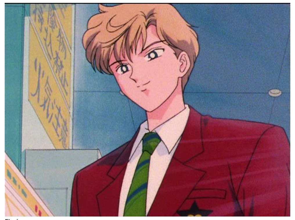
Fig.1: Haruka's first appearance in Sailor Moon S (episode 92, 1994)

As was shown by the audition of the Di Gi Charat anime series, the voice database and the visual database cooperate seamlessly in most cases. I would like to emphasize, however, that there are always possibilities of deviation, since the visual appearances and the voices of characters are created independently from each other. Occasionally, the voice can deviate from the visual elements, in what must be an unconventional combination of the two databases. To illustrate this point, I will take a closer look at an anime from the 1990s, namely the Sailor Moon series mentioned before. The story revolves around themes of love and friendship among girl-heroines: schoolgirls who acquire the special ability to transform into sailor-warriors, fight against evil, and form great friendships. Although this series was originally aimed at young female recipients, it became highly popular within a wider audience, including otaku, and had a considerable effect on the Japanese society at that time. Moreover, Sailor Moon is particularly suggestive and important for discussing the relationship between the visual and the vocal database. Hence, I will analyze Haruka Tenou, also known as Sailor Uranus, who appears in the third season of Sailor Moon S (1994–1995), since this character exhibits a radical tension between the two databases.