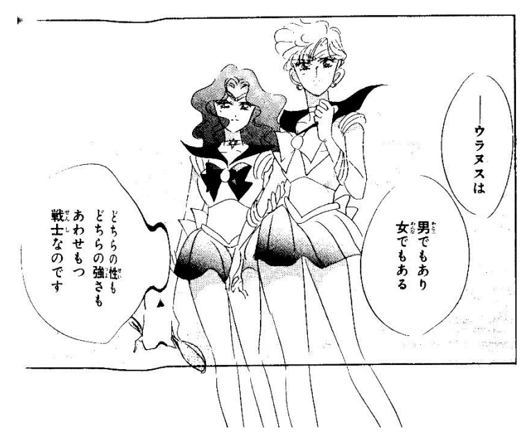
Fig. 5: Sailor Uranus reveals his/her sexual identity to be androgynous (TAKEUCHI 1994/3: 20)

Manga and anime are different media. In manga, there is no possibility for a direct vocal expression, so the presentation of Haruka is inevitably different to her anime counterpart. However, if the anime version had been more loyal to the original—which defines its gender by corresponding first-person pronouns and costumes—the anime-Haruka would have spoken differently: when Sailor Uranus said »atashi«, the voice would have betrayed a higher pitch, it could have sounded much more feminine. In comparison with the androgynous manga-Haruka, her anime version crosses the gender boundary and stands out significantly, since the identification of Haruka's gender is not an important issue in the anime version. While Haruka's gender identity is the subject of six episodes in the manga, the same issue is resolved within a single anime-episode. But while Haruka's gender is only a minor explicit topic within the anime narrative, these questions are presented as much more complicated in formal terms. In the episodes that follow, she stays in male attire and speaks in a much lower-pitched voice (even in comparison to the only male protagonist, Mamoru), although she is definitively presented as female. For this reason, we can say that she deviates from stereotypical female characters to a large degree.