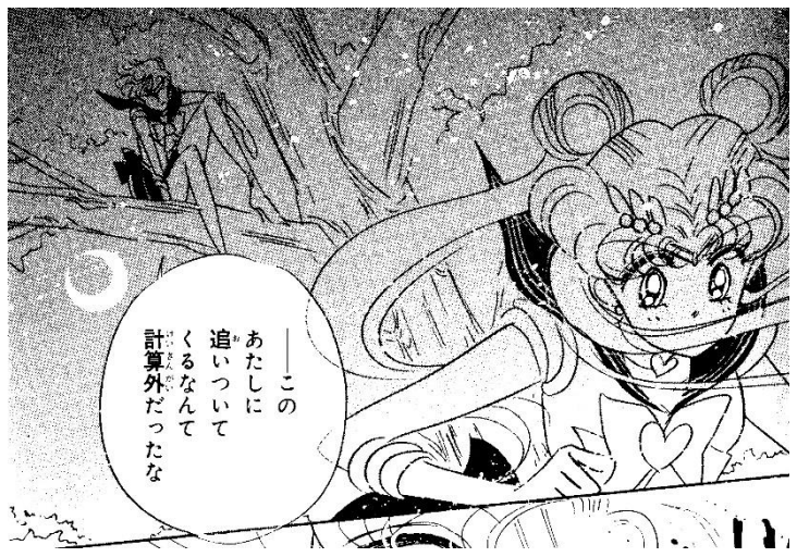
Fig. 4: Sailor Uranus calls herself »atashi« (TAKEUCHI 1994/2: 61)