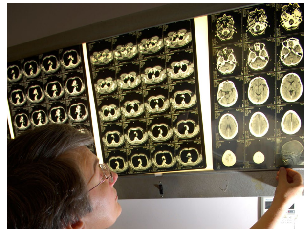
2 Example of hanging CT scans on a light box.

a bright screen. As suggested by this photograph, viewing images on the light box is associated with perceiving from a distance static images that are strictly ordered in a static frame. The x-rays could not be changed once they were printed out on film. Only their order at the light box was reconfigurable, and to a certain degree instruments such as the pointing stick or magnifying glasses could help to guide the diagnostic gaze and bridge the operational and probably epistemic gaps between distant users and static images.