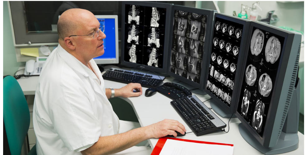
3 Radiological diagnostics at a workstation.

CT exams with a thousand images are becoming common and simply cannot be managed effectively on film. PACS viewing software can be used to dissect, analyze, magnify, or reformat image data in an infinite number of ways. 12