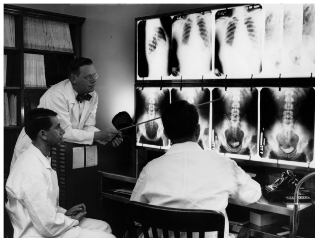
1 Photograph of x-ray diagnostics at Hermann Hospital in 1953 using a light box.