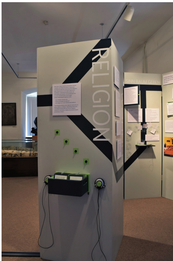
Fig. 3: Exhibition view on the Panels: Religion, A transparent Exhibit, Esther, Markus, Photography by Nikolas Magin © SinnRäume

The exhibition also shows how meanings and definitions are created and how they can change. This is reflected in the design of the object descriptions in the showcases. The loan objects came from the homes of our interviewees. The respective descriptions include standard data on size and origin, but this information is augmented by statements on the subjective meaning of the objects and in one case on the process by which a member of our project team collected contextual data on that specific object.