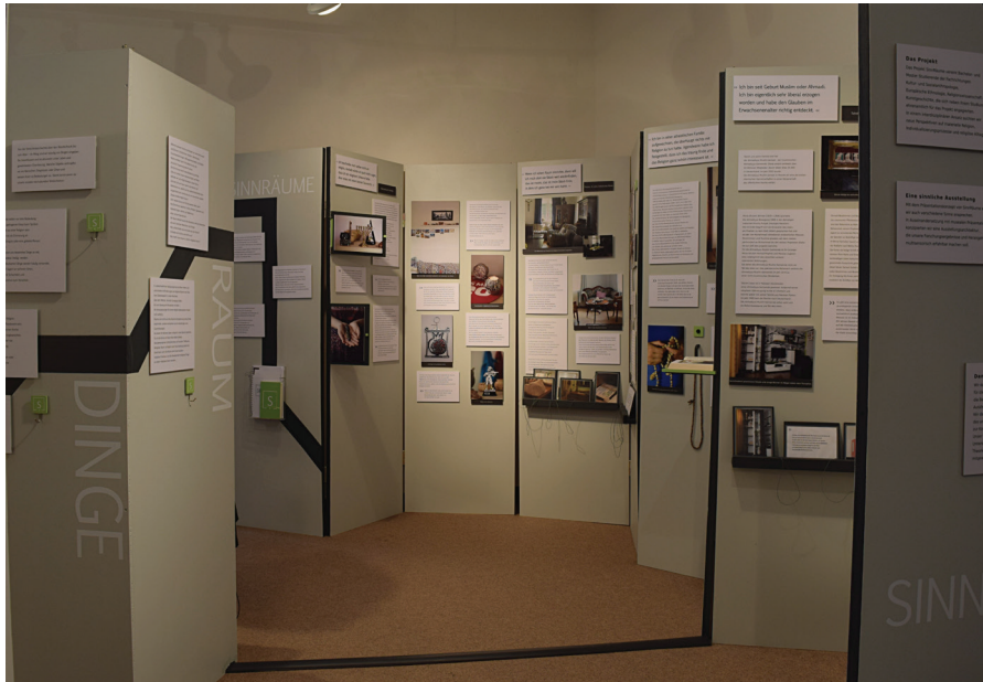
Fig. 1: Exhibitionview, Sinnräume , Photography by Wolfgang Magin © Sinnräume

courses on the individualization and privatization of religion were also applied in our interdisciplinary methodology, as were spatial theoretical reflections on private space and corresponding religious concepts of life and living together. The results of our deliberations were contextualized in the terms and concepts of religious studies and made tangible in the form of texts, images, and quotations from the interviews (Fig. 1).