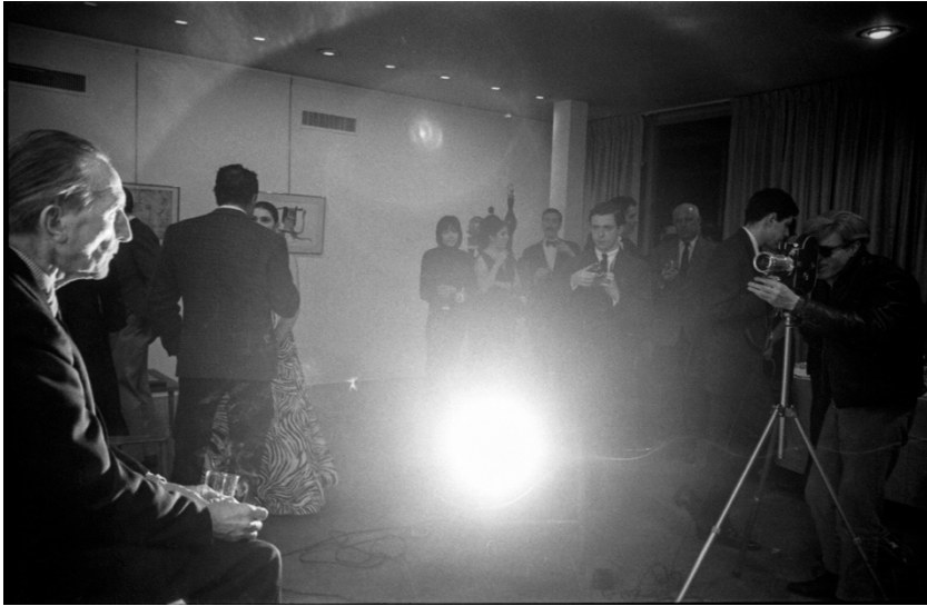
Fig. 3: Nat Finkelstein, Benedetta Barzini, and Marcel Duchamp, 1966.

Something strange has happened here: were Tomkins' story not in circulation, we would never look at the Screen Tests and at Finkelstein's photographs and then conclude that an Italian actress was throwing herself on Marcel Duchamp's lap throughout the filming of the first two Screen Tests. The evidence alone does not suggest any such thing. But, having heard this shred of gossip, we must acknowledge that it is possible. As Gavin Butt has argued, treating gossip as an object of historical inquiry reveals the extent to which all historical claims are – 'like gossip's narratives' – 'projections of interpretive desire and curiosity'. [34] Whether it was Tomkins, or Hahn, or Duchamp himself, someone's desire conjured this tale into being and brought it into the field of historical possibility. The responsible historian must admit that, while the tale cannot be proved, it also cannot be disproved. In treating this shred of information seriously enough to try to verify it, I have made it possible by participating further in this gossip's circulation. In the spaces between the frames of Finkelstein's photographs and the frames of Warhol's Screen Tests, there is enough room for Barzini to wander back across the gallery and into Duchamp's lap. If we grant her passage, her way in is clear.