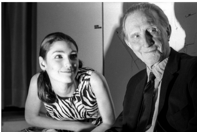
Fig. 2: Nat Finkelstein, Warhol Filming Duchamp, 1966. Photograph courtesy of the Nat Finkelstein Estate.

A series of photographs documenting the evening strengthen this hypothesis. Warhol attended the American Chess Foundation event with Nat Finkelstein, a photojournalist who documented many scenes of Factory life between 1964 and 1967.[32] In one photograph (Figure 2) Warhol films Duchamp. The older artist faces Warhol's camera and a crowd of onlookers while several gallery guests talk amongst themselves in the background. Visible