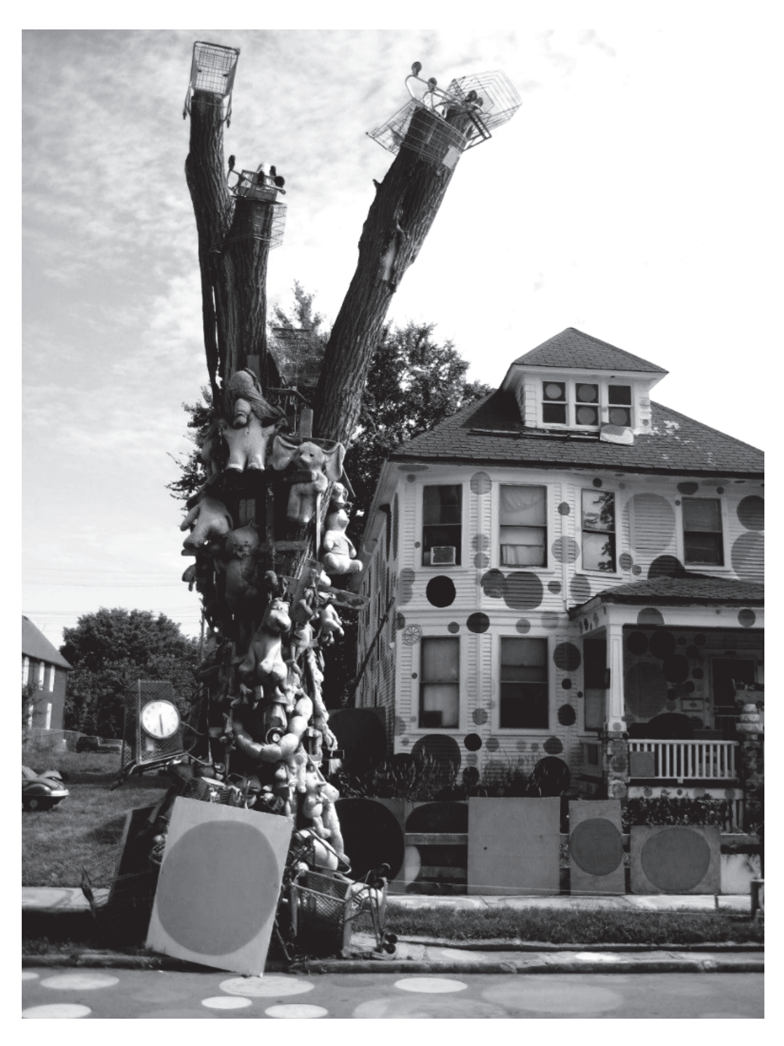
Fig. 3. The People's House aka »Dotty Wotty,« with Tree of Toys in foreground, Heidelberg Project, © Heidelberg Foundation (photo by Daniel Stein, 2011). Used with permission.