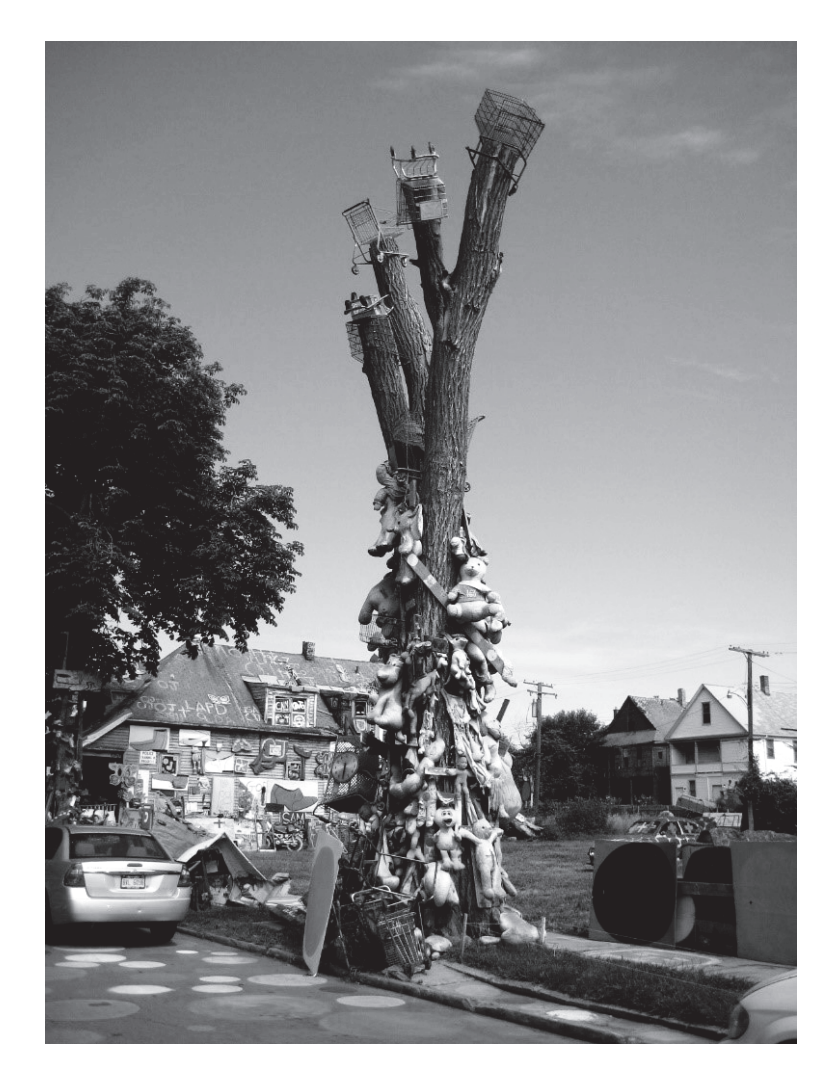
Fig. 2. The Tree of Toys, with the Obstruction of Justice House in background, Heidelberg Project, © Heidelberg Foundation (photo by Daniel Stein, 2011). Used with permission.

transformation of discarded objects into meaning carriers aptly describes the project's creative recycling of urban trash as an intervention into Detroit politics. Moreover, following Brian Sutton-Smith, if a game consists of a potentially unlimited »series of plays [...] and a series of playful alternatives,«<sup>49</sup> then the Heidelberg Project emerges as a powerful and widely recognized instance of playing the city and an endeavor to produce playful – imaginative, magic – alternatives to postindustrial decay and neoliberal urban renewal. In other words: The Heidelberg Project ceases to be confined to the magic circle, in which play is generally played for play's sake, disseminating its message into other neighborhoods, throughout the city, the country, and indeed the world.