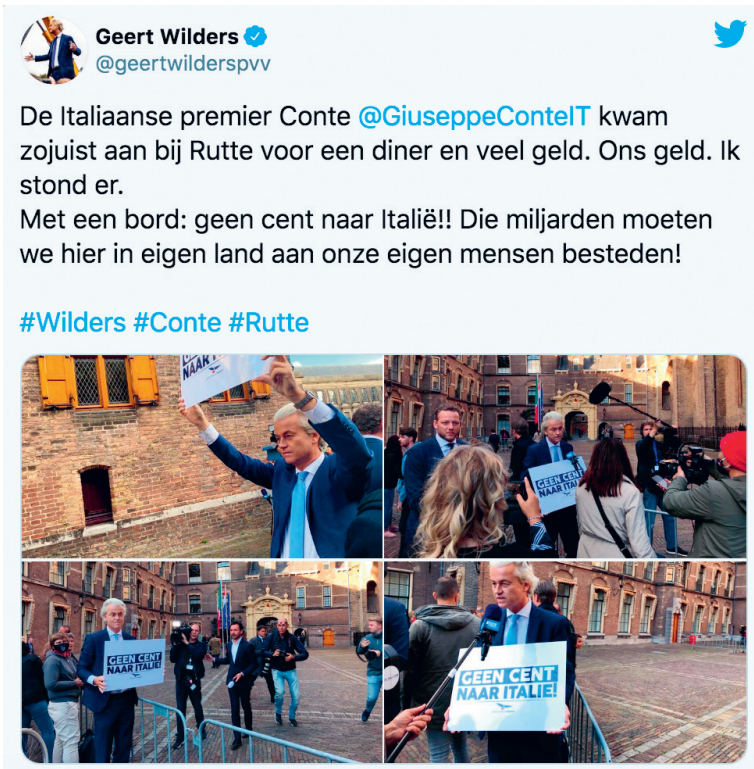
Fig. 1. “Not a Cent for Italy”

of the Parliament by far-right leader Geert Wilders, who raised a sign reading, “Not a cent for Italy.” 2