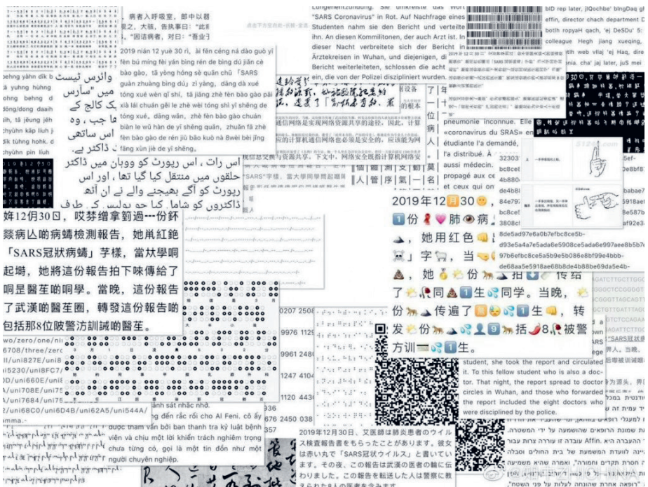
Fig. 1: The circulation of the censored report in different languages.