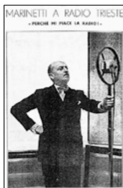
Illustration 4: Marinetti at Radio Trieste, from Radio Corriere , April 1932, p. 9.

As far as the development of an Italian television service was concerned, EIAR was encouraged by the first public demonstrations of a mechanical television apparatus in England (1926) and the USA (1927) to set up their own television laboratory in Milan in 1928. On 9 February 1929, the semi-Futurist newspaper L'impero published an article on »The Progress of Television«, which predicted that within a few years there would be as many television sets in Italy as there were already telephones and radios. In the following months, the Corriere della sera reported on the first televised theatre show by the BBC in London, and on a televised performance of a Montmartre singer in Paris. Marinetti was clearly aware of these events, as in the Manifesto of Futurist Cuisine , published in 1930, he referred to that »immense network of long and short waves that Italian genius [i.e. the radio pioneer Guglielmo Marconi] has flung over the oceans and continents, [and] those land-