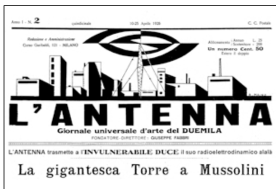
Illustration 3: Titlepage of the radio journal, L'antenna .