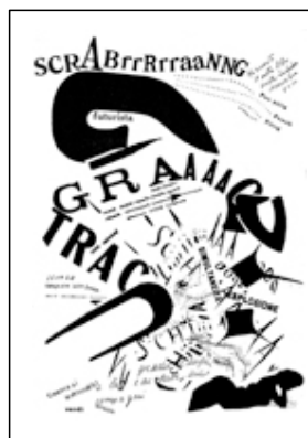
Illustration 2: An example of parole in libertà from Les Mots en liberté futuristes (1919).

In 1914, during one of his many stays in London, Marinetti also began to record his poetry on five 78 rpm discs, 1 a practice he was going to continue throughout the 1920s and 30s. In the field of theatre, Marinetti developed several new dramatic genres, designed to capture, »the many-hued, many-voiced tides of revolution in our modern capitals« (Marinetti 2006: 14). But he did not only write plays that reflected the modern, technologically based forms of communication: he also integrated them in his theatre performances. At the opening of a Futurist exhibition at the Doré Galleries in London, on 28 April 1914, Marinetti recited several passages from his novel ZANG TUMB TUMB. On the table in front of him he had a telephone, which he used to instruct his assistant, the painter Nevinson, in the adjacent room to supplement his recitation with appropriate sound accompaniment. This first recorded use of a telephone in a stage performance was followed a few weeks later, on 17 May 1914, by Marinetti declaiming his latest poetry via telephone from London to a Futurist performance that was taking place at the Sprovieri Gallery in Naples (Berghaus 1998: 172-175, 234-240).