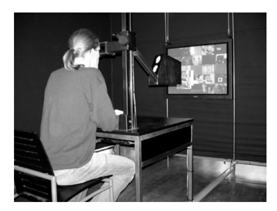
Fig. 1. EyeVisionBot

host the control software. The latter controls and analyses the gaze tracking, accesses the database, and steers the visual output. Simply put, the eye-tracking device detects the viewing direction of the user. With this it is possible, given a display of twenty-five images arranged in a 5 x 5 matrix, to determine which images are looked at and for how