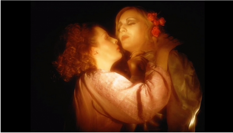
Fig. 8: Der Tod der Maria Malibran (Werner Schroeter, 1971), courtesy of Edition Film-museum / Film und Kunst GmbH.