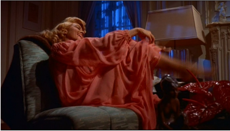
Fig. 4: Written on the Wind (Douglas Sirk, 1956)