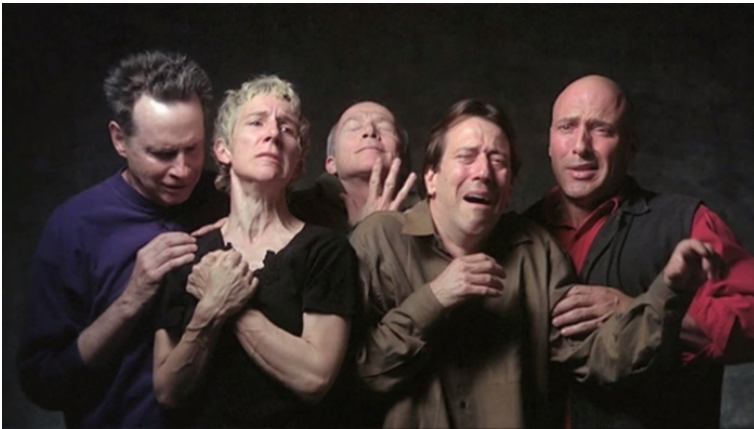
Fig. 5: Quintet of the Astonished (Bill Viola, 2000), courtesy of Bill Viola & The Getty Center.

work employs extreme slow-motion to reveal affective transitions between five major ‘negative’ emotions and their circulation between five figures, to capture the ‘steps in between’ which ‘the Old Masters did not paint’.[56] Nevertheless, the marriage between the affective interval and the melodramatic moment is perhaps most visible in certain strands of experimental cinema from the 1960s and 1970s, notably in films that privileged stylistic excess and bodily pathos. The aforementioned film The Death of Maria Malibran by Werner Schroeter will serve as a case study.