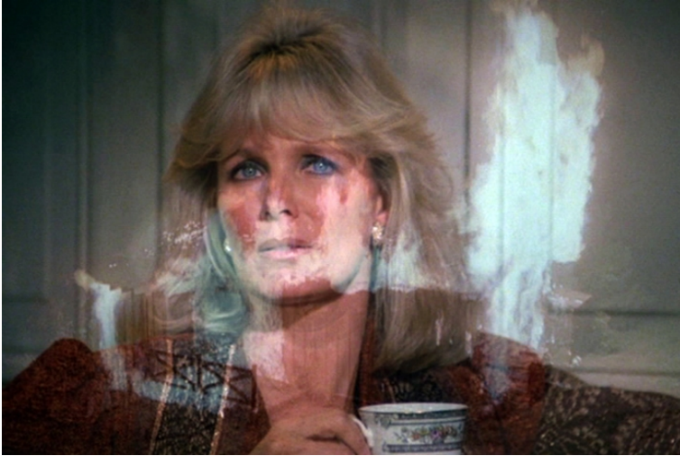
Fig. 1: The Dark, Krystle (Michael Robinson, 2013), courtesy of Video Data Bank.

images makes these moments stand out as fleeting signifiers of passion that still resonate within the collective memory attached to the show. This double-edged process of extraction and fetishisation expands the gap between the historical context from which the images emerged and the utopian promise of all-prevailing expression – the stuff which melodramatic situations are made of.