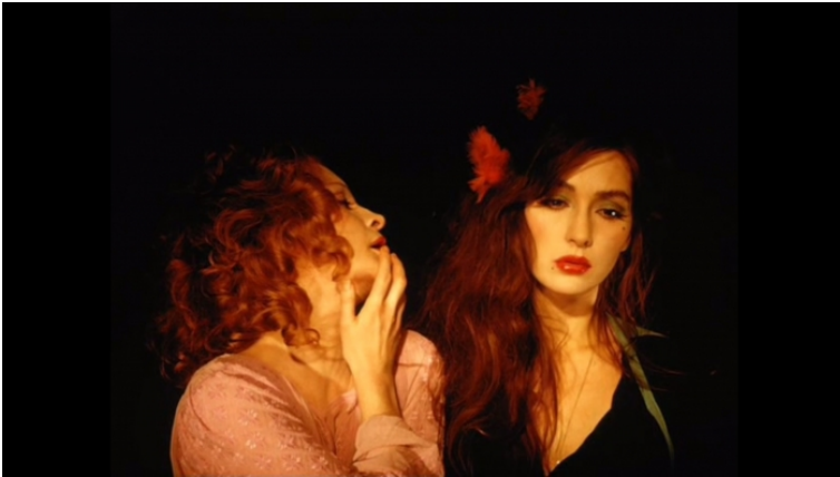
Fig. 7: Der Tod der Maria Malibran (Werner Schroeter, 1971)

down even further in order to let the normally imperceptible micro-operations between bodies, or more precisely between bodily fragments (lips, eyes, hands), stand out. Thus, we can perceive how even recognisable gestures of passion are becoming estranged and uncanny while waiting to be actualised, and how these movements involve not only mutual desire but also manifold dissonances – for example, when Magdalena Montezuma slowly raises her eyes and moves her lips towards a grotesque-looking diva as if trying to kiss her, although all the diva does is open her mouth without issuing a sound. As with Waldenfels's diastasis, pathos always arrives too early to be fixed with immediate meaning, while response is principally delayed, imperfect, and discordant with its perceived object.[61] Both pathos and response therefore constitute the same event, the same interval between the 'not yet' and the 'no longer' that brings forth a differentiation of elements and relations.