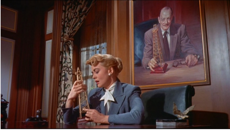
Fig. 2: Written on the Wind (Douglas Sirk, 1956), courtesy of Universal Pictures.

mary of an emotional situation'[27] but also expose how this emotional situation comes into being and conserves itself in time. Paul Coates spoke about the 'apocalyptic desire to halt time in its stride', which 'reveals the [melodramatic] form's essential stasis', forever enclosed in the space of innocence.[28]