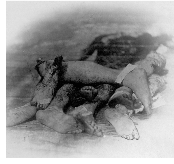
Fig. 3: Reed Brockway Bontecou: A Morning's Work [a.k.a. FIELD DAY], 1865, Otis Historical Archives, National Museum of Health and Medicine

The corporeal disintegration coincides with the political: in contrast to the official rhetoric calling for the heroic sacrifice of a limb to save the nation's body,24 this dismemberment does not emerge from, or refer to, an antecedent organic unity. Instead, it visualizes what Gilles Deleuze describes as Walt Whitman's disenchantment after he had exuberantly greeted the conflict and then seen it turn into a fratricidal catastrophe: »its acts of destruction affect every relation, and have as their consequence the Hospital, the generalized hospital, that is, the place where brothers are strangers to each other, and where the dying parts, fragments of mutilated men, coexist absolutely solitary and without relation.«25 The radical disruption of all ties and political adhesion, the fragmen-