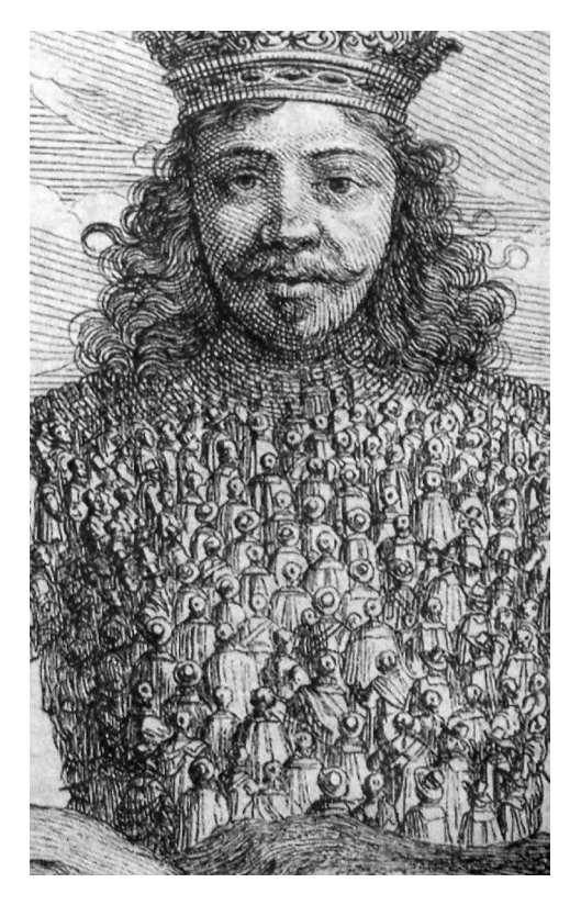
Fig. 2: Thomas Hobbes, Abraham Bosse (?): Detail from the frontispiece of Leviathan , Or: The Matter, Forme and Power of A Commonwealth Ecclesiasticall and Civil, 1651

Accordingly, the head generates a concentric arrangement of the surrounding elements of state and with it their consolidation or fusion. It produces tight political and aesthetical structures without blank positions. Consequently, the beheading of the state (in 1649, also in 1793) must involve a loosening of connections. Some eighty years after the War of Independence, this might motivate the lack of rigid closeness in Brady's republican composite and the void in the midst of the senators. One place remains empty; it is no longer occupied by the monarch, but can serve as position for everybody, an opening for the direct entry of always another citizen into the state's representational structures. »The statue of the father gives way to a [...] portrait that could be of anybody or nobody.«19