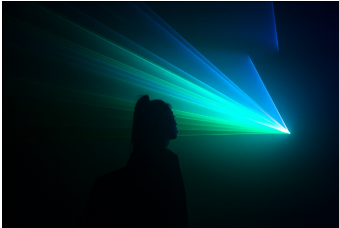
Fig. 7: Lasers of LSP © Gridspace, 2019.

Moving away from embodied futurism, sound and light artist Edwin van der Heide, based in the Netherlands, continues to develop and explore the relationship between sound and light in movement in his LSP (Laser Sound Performance) (2003-2019). In this case artificial fog highlights the three-dimensionality of the laser projections through the space onto the front screen. The greenish light patterns retain a very formal geometric quality as they are manipulated in relation to the electronic sounds.