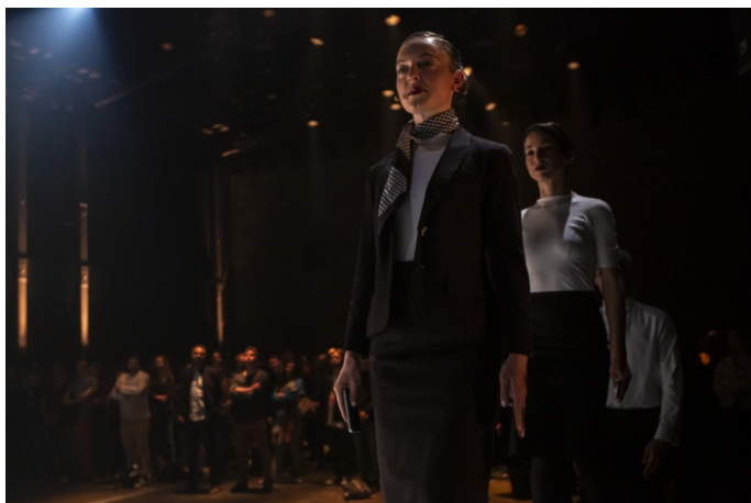
Fig. 5: Ergonomics © Gridspace, 2019.

contemporary work environment and is articulated throughout the performance, along with cliché uniforms, gestures, and tone of voice.