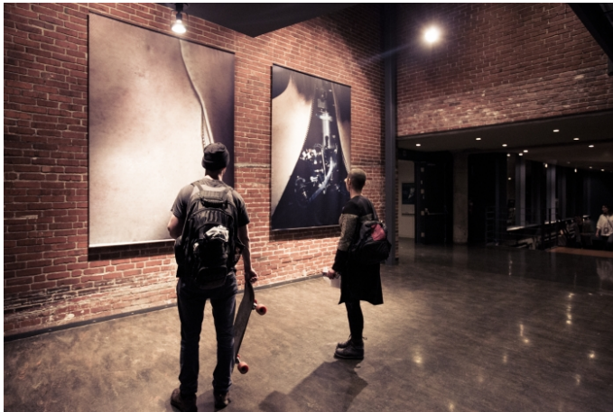
Fig. 2: Photography at Usine C © Gridspace, 2019.

This year was the special 20 th anniversary edition of the festival, which was acknowledged not only in a retrospective immersive performance but also in its exhibition of photographs at Usine C that documented selected moments from the beginning. On the festival's programming concept, founder and artistic director Alain Thibault notes in his introduction to the festival guide that the programming 'focussed on performance, reflects the aesthetics and tendencies that seek a more intimate dialogue between people and technology, moving beyond the simple notion of the audience by offering more immersive and extreme experiences'.[4] The programming was generous in scope, with work ranging from internationally recognised digital artists to a promising media arts student collective, while exploring a variety of intimate relations between the digital technologies and audience members. Similar to films in film festivals, digital artworks also circulate among a range of other festivals, as evinced in the biographical notes of the various participating artists and groups. ELEKTRA serves as a node among others, such as Sónar in Barcelona, SMAK in Ghent, Ars Electronica Festival in Linz, Stedelijk Museum in Amsterdam, V2_'s DEAF in Rotterdam, ICC in Tokyo, NAMOC in Beijing, and Transmediale in Berlin.