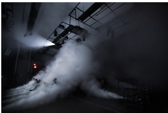
Fig. 3: Hentschlaeger's FEED.X fog © Gridspace, 2019.

Usine C, the former Raymond Factory, located just north of the Gay Village, remained the centre of the festival, where all the multimedia performances took place outside of the SAT's fulldome. The repurposed factory serves as a well-known venue for experimental theatre, dance, and electronic music performances in the city. Below, I will describe a selection of five of the performances to give a sense of the rich variety of works programmed.