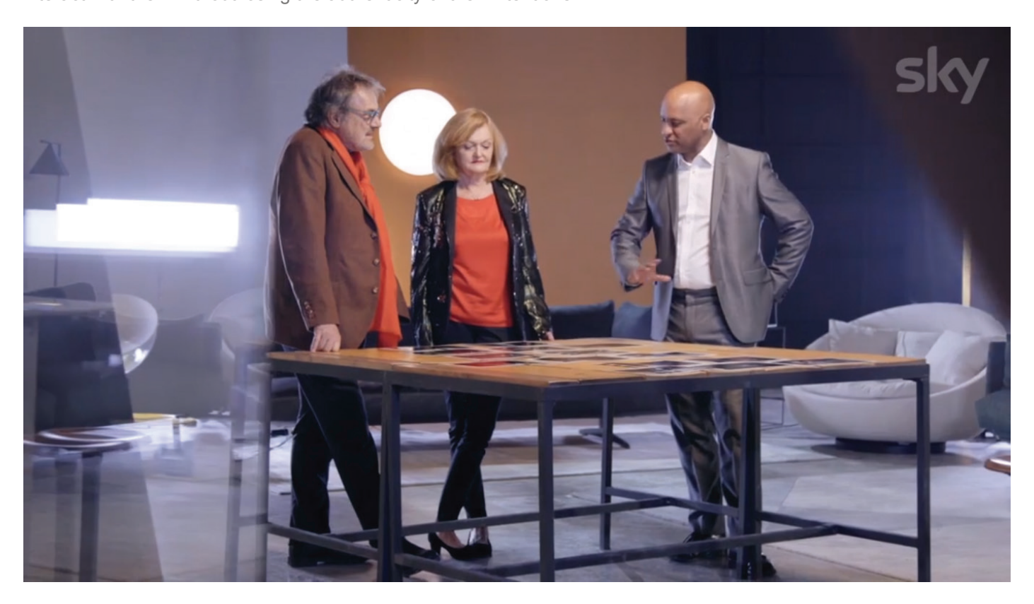
Figure 6. Frame from episode 'Sanctuary,' 3: 8.

The British partners' need to control the judges' communication style has prompted the Italian authors to find ways to interact with them without losing the authenticity of their intentions.