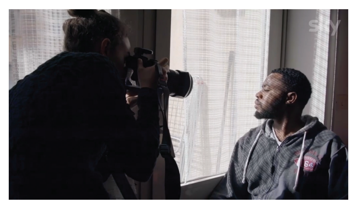
Figure 4. Frame from episode 'Sanctuary,' 3: 8.

MoP is unique also because it is a talent show with no performance. There are no songs or dances, no moments in which the artists express themselves before the judges. During the episode's task, the contestants take hundreds of pictures, but when the time comes to present them, they need to select, depending on the task, from one to a maximum of five images for the judges to evaluate. Only at this stage (or after) can the video recording of the moments when the pictures were taken be viewed (provided it was caught on camera).