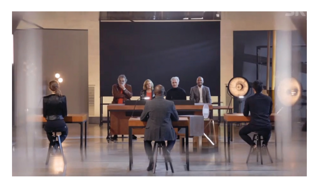
Figure 1. Frame from episode 'Sanctuary,' 3: 8.

The mechanism of MoP , however, is far from original, and it demonstrates – already answering one of my research questions, at least partially – that its narrative engine is not any different from that of many other locally adapted talent shows. A group of photographers with varying backgrounds and skill levels, compete for a significant money prize.<sup>28</sup> The contest involves tasks where the photographers are required to work with different genres, from studio portraits to street photography, from reportage to nudes, from animal pictures to archaeological landscape, dealing with subjects that can be either picked or assigned. The editing of photos is supported by a professional who changes every time,<sup>29</sup> but the last word pertains to a jury that is made up of three internationally renowned personalities in the photography world: the innovative but controversial Italian photographer Oliviero Toscani, the British curator and cultural historian Mark Sealy, and visual editor Elisabeth Biondi, who was born in Germany.<sup>30</sup> The jury is tasked with making the contest progress by eliminating one contestant after another, until a winner is designated.