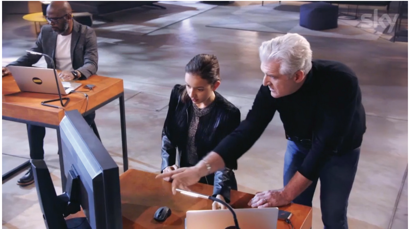
Figures 2, 3. Frames from episode 'Sanctuary,' 3: 8.