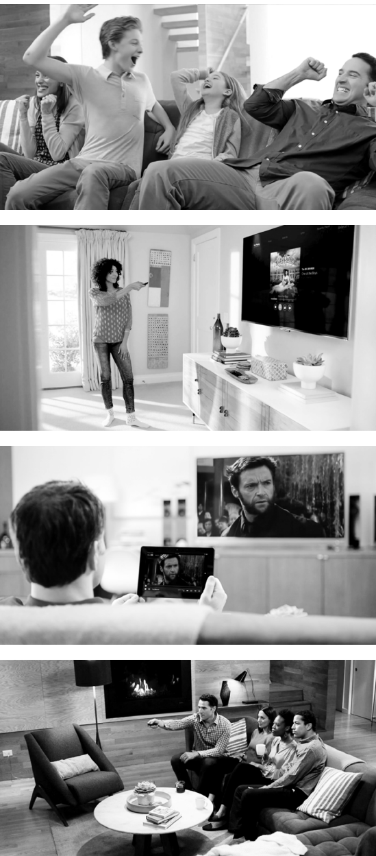
Fig. 1–4: The various body positions suggested in a commercial for Kindle Fire TV

transfers the film image from her tablet back to the bigger screen in front of them. 52