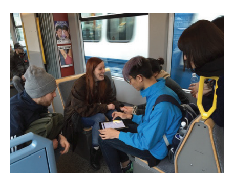
Figure 2/3: LucyZH player race across the city by tram, browsing through the virtual card archive/ LucyZH logo with an intercultural fantasy-animal.