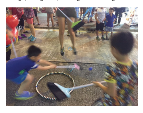
Figure 4/5: Late night engagement in the magic circle of Dragon Polo, Hong Kong (Mong Kok)/ Dragon Polo logo.

Only a few individuals disrupted our play: an old street artist asked us to stop the game every 5 minutes for his performance, for which he had to take a 30 meter in-run through our game field (he jumped through a hoop on a mattress). This gave the game a very spontaneous and volatile touch. At another point, a group of old men started a heated discussion with our Chinese team members. They didn't understand why we wouldn't want to play in a park, where we had more space, which should therefore be more fun for us.