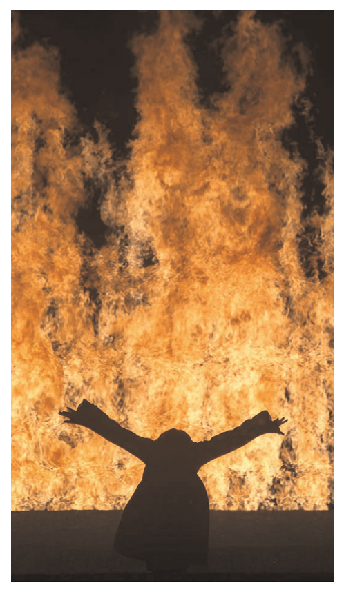
Fig. 3: Bill Viola, Fire Woman, 2005; color high-definition video projection; four channels of sound with subwoofer (4.1); screen size: 19 x 10 3/4 ft (5.8 x 3.26 m); room dimensions variable; 11:12. Performer: Robin Bonaccorsi.

The installations feature a projecton onto a tall, vertically-oriented screen, where the soul of the literary hero is awakened after his death and raised to the sky through a spectacular waterfall. Also, a second tall projection presented the vision of a woman standing up against a wall of fire and then falling into the water. After these two mythical and mystical apparitions the public at the Grand Palais was invited to step back into the more concrete and human body in the diptych Man Searching for Immortality/Woman Searching for Eternity (2013), where two naked figures of senior citizens are projected on large vertical slabs of black granite, as if they are carved out over their graves; their skin is explored with a small light, trying to isolate diseases or corruptions. The seven submerged bodies of The Dreamers suspended between life and death closed the exhibition and the public's spiritual journey.