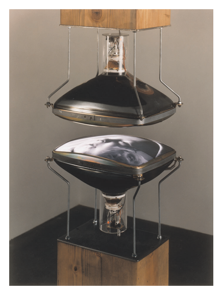
Fig. 2: Bill Viola, Heaven and Earth, 1992, video installation; in a small alcove, a wood column extends from the floor and ceiling with a gap in the center formed by two exposed monitors facing each other, two inches apart, mounted to upper and lower columns respectively, a black-and-white video image on each monitor; 9 \frac{1}{2} x 16 \frac{1}{8} x 18 \text{ ft} (2.9 x 4.9 x 5.5 m); 29:52.