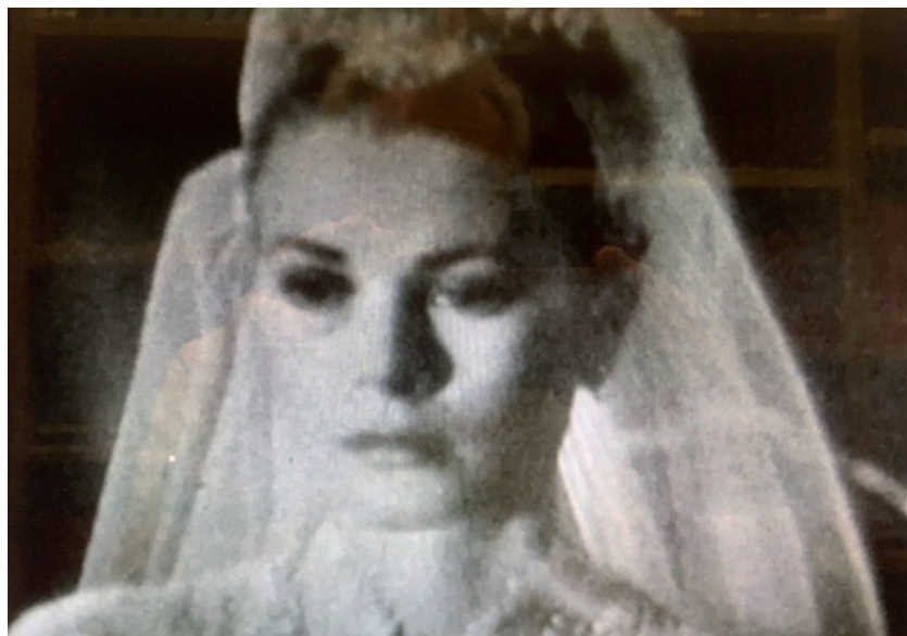
Figure 3. Close-up of Grace Kelly during the ceremony as covered by television; screenshot of the 16 April 1966 edition of BBC2's Plunder .