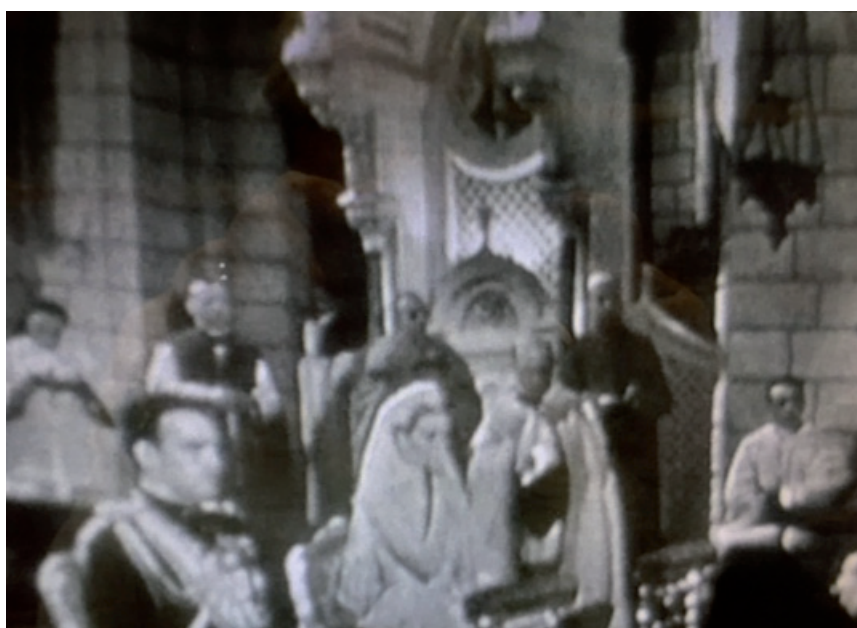
Figure 4. Grace Kelly dabbing at her eye with a handkerchief during the ceremony as covered by television; screenshot of the 16 April 1966 edition of BBC2's Plunder .

of the cathedral, and the key one behind the altar. This one shows the couple from an oblique frontal angle with Grace in the centre of shot. From this new angle, we can see her dabbing at her eye with a handkerchief.