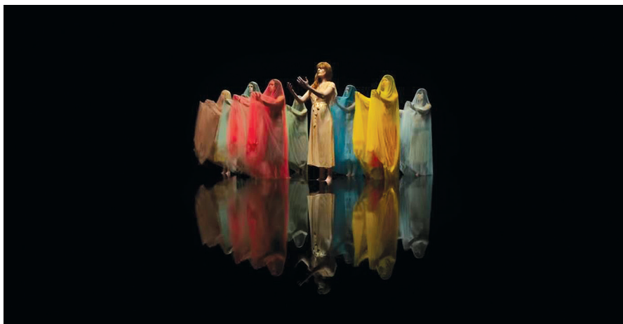
Fig. 2: The women lift their hands, perhaps in an act of adoration. Music video still from BIG GOD , Florence + The Machine, 00:00:14.

Motionless and colourful, a number of women stand in a black void, their reflections appearing in the water at their feet (fig. 1). All but the woman in the centre are veiled in transparent chiffon; the unveiled woman wears a nude-coloured silk dressing gown and underwear. We hear the howling of the wind, then percussion; a piano tune starts as the camera continues to zoom in. The women begin to move their hands towards the black sky (or heaven?) but then let them sink down onto their foreheads in a position of despair (fig. 2).