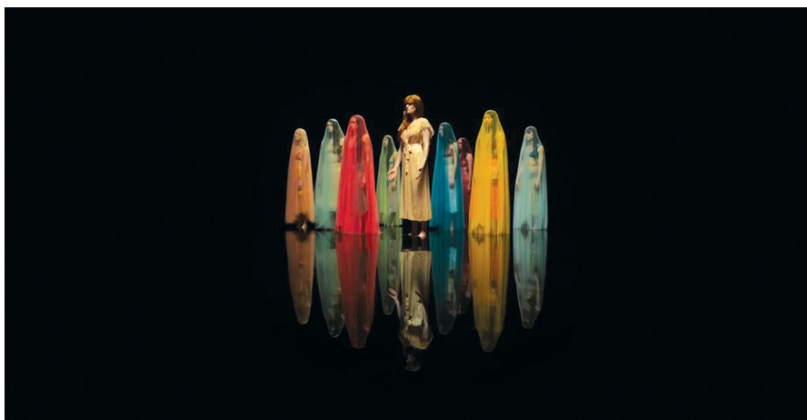
Fig. 1: The veiled women. Music video still from BIG GOD , Florence + The Machine, 00:00:04.