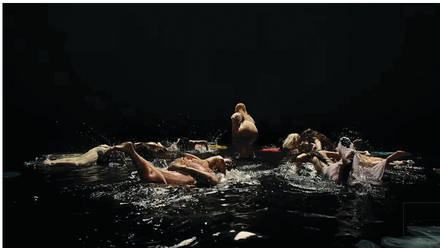
Fig. 4: Getting better after profound sadness. Music video still from BIG GOD, Florence + The Machine, 00:01:57.

We see Florence go through the most extreme emotional depths, where the pain is almost unbearable, but even there hope rises, and she finds a way out of the pain (fig. 6) and to a new strength.