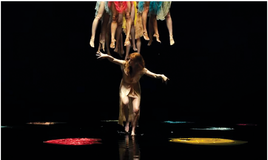
Fig. 6: The way out of the pain. Music video still from BIG GOD, Florence + The Machine, 00:02:17.

respond to a new collective perception” (Belting 2011, 36). Here Belting elaborates Warburg’s idea of recurrent motives and representational strategies and focuses on how the qualities of a specific media – that used to transmit an image – shape the perception of the beholder.