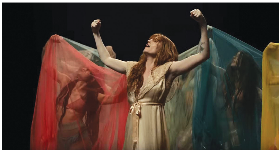
Fig. 3: What do the women receive? Music video still from Big God , Florence + The Machine, 00:00:46.

“You need a big god, big enough to hold your love”, laments Florence Welch, the unveiled woman, singer in the British indie rock band Florence + The Machine, and then adds, “You need a big god, big enough to fill you up”. 1 And while her voice still modulates the “up”, she takes several deep breaths and opens her arms, as if to signal physically her willingness to receive whatever comes (fig. 3).