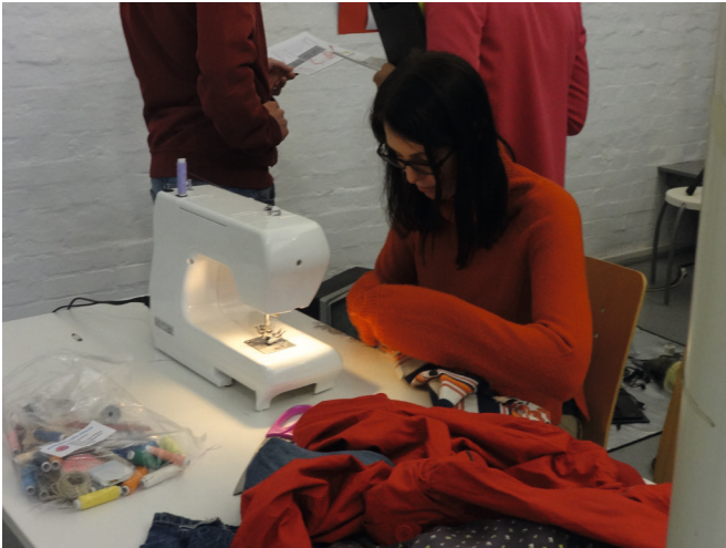
[Fig. 6] Exhibition: Dysfunctional Things. Project: Kleiderflüsternde Nähwerkstatt / Clothes Whispering Sewing Room (Nadine Teichmann). Photography: Martina Leeker & Laila Walter, Lüneburg 2016.

(1) The discourse-on-things and on techno-ecology were taken on seriously and experienced in an exaggerated manner. Non-knowledge and incomprehensibility generated by these discourses, which emerged from the complex agencies and the technological environments, became new possibilities of (non-) knowledge. This knowledge from non-knowledge, and its effects, were clear and concise in the “Kleiderflüsterin” (clothes whisperer). New levels and forms of sensibility were reached by listening to damaged clothes and hearing of their desire for repairs.