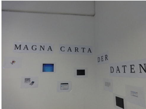
[Fig. 5] Exhibition: Dysfunctional Things. Project: Magna Carta der Datenrechte / Magna Charta of Data Rights (Martina Keup). Photography: Martina Leeker & Laila Walter, Lüneburg 2016.

Data rights have become a very important topic in the world of Owlglass prank in the exhibition, because smart things are technical devices controlled by algorithms collecting and processing data.