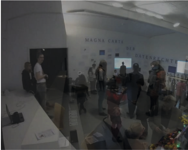
[Fig. 1] Exhibition: Dysfunctional Things. Photography: Martina Leeker & Laila Walter, Lüneburg 2016.

Interfaces, through which human agents gain access to technological environments, are important in digital cultures. Interfaces enable not just control of technological operations; they shape, through their design, the behavior of users. They are therefore a sensitive gateway to the technological worlds and models and regimes of human-machine interaction. The exhibition asks what would happen when, assuming a radical equality of things, interfaces are disrupted and cannot be thrown away? In this context, a workstation was created that had a defective computer mouse, which performed self-willed movements enabling the production of strange drawings.