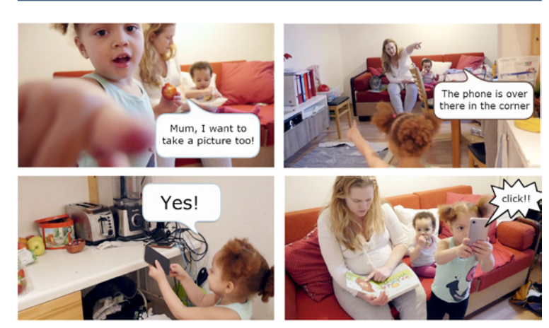
Fig. 3: Want to take a picture; film by Claudia Rühle, 'comic-strip' by Erik Wittbusch

Meanwhile, her younger sister watches her attentively. Young children in particular can shift their focus rapidly from one activity to the other and may potentially involve all people present, irrespective of their personal preferences. Although it is sometimes possible to withdraw into a purely observational role (with a camera) in the background, ethnographers and their media are always participating. Their presence is normalised by young children in a specific way, since they rarely differentiate between researchers and other visitors or at least do so in a different manner than adults.