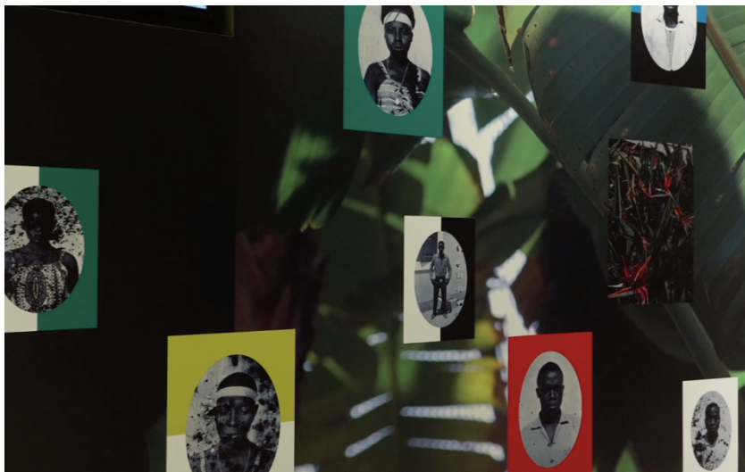
Fig. 3: Still frame of 'Visions of Empire', 'Estudio no boulevard' / 'Studio in the boulevard' by Sebastião Langa, Ricardo Rangel, Lourenço Marques, 1962, CDFF – Centro de Documentação e Formação Fotográfica, Moçambique.

part of an individual and emerging nation's identity strategy. The photograph of the blackboard in a tropical exterior, with someone concentrating on writing and someone facing the camera during a class, releases a parity that contrasts with the previous pyramidal composition of colonial classrooms.