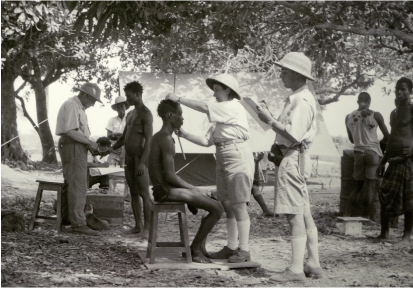
Fig. 1: Visions of the Empire.

The remembrance of the most remote time continues with the photograph of the coloniser, a Portuguese evocation of the 'explorers of Africa'. Serpa Pinto was portrayed in 1877, the oldest photograph in the exhibition. The 'illustrious' adventurer posing, with a child servant in the background. Another photograph shows him resting in an armchair, a straw hut in the back, looking vigilant for the camera. The second set of images, the Other Documented and Displayed, highlights other aspects portrayed, including highly charged faces and photographs of colonial families. As Bandeira Jerónimo notes, it is crucial to understand the project of 'ethnographic documentation' that organised in part the colonial narrative of such visual policies for the territories. The photographs of nude native women, for example, gendered colonial bodies. These elements are repeated in several others. Despite the discomfort, in one of the photographs, someone faces the camera and the subalternity of the asymmetrical gaze is diminished. Another disturbing moment is a photograph of a low-class settler family, in the middle of a dusty floor, an expression of despair on their faces. It leaves the impression of facing a displaced puzzle.