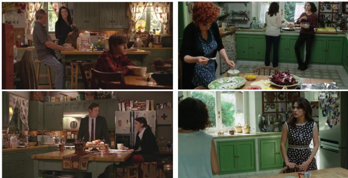
Figure 2. The green kitchen.

As we mentioned above, the action takes place in Rome, specifically in the neighbourhood of Fiumicino, which is a completely different location compared to Berkeley, California. However, the authors tried to reproduce the symbolic value of the original settings and spaces. Sometimes the adapted space works thanks to a cultural correspondence of the use and purpose of the set. The big grandparents' house represent the connection point for all the family members: a messy, but comforting environment, with a spacious green kitchen (the same color of Parenthood grandparents' kitchen), a patio full of plants and vegetation. The ritual Bravermans gatherings around the table to eat all together adapts particularly well to the Italian tradition of family lunches and dinners, therefore, unsurprisingly, such moments keep their dramatic purpose conveying a range of emotions, from convivial, joyful occasions to misunderstandings and outbursts of rage.