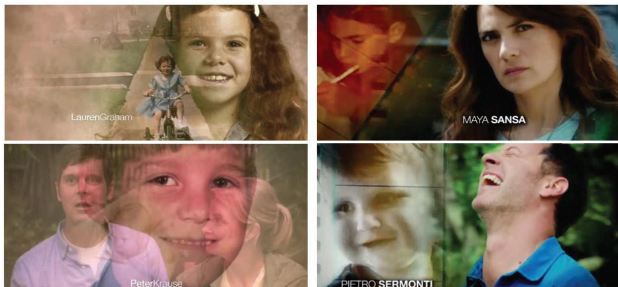
Figure 1. Parenthood (left) and Tutto Può Succedere 's (right) opening titles.