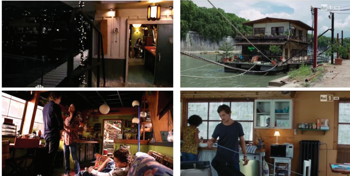
Figure 3. Crosby's (left) and Carlo's (right) houseboats.