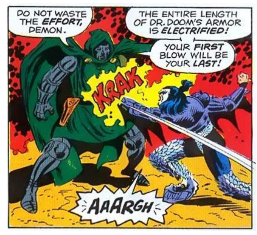
Fig. 2: Doctor Doom battles Kiss in Marvel Comics Super Special #1

The remaining three cases definitely featured Doctor Doom, including a very enjoyable guest appearance in Marvel Comics Super Special starring the band Kiss (1977, cf. fig. 2). Hence, these were added to the first draft of the actual corpus, bringing it to a grand total of 246 comic books.