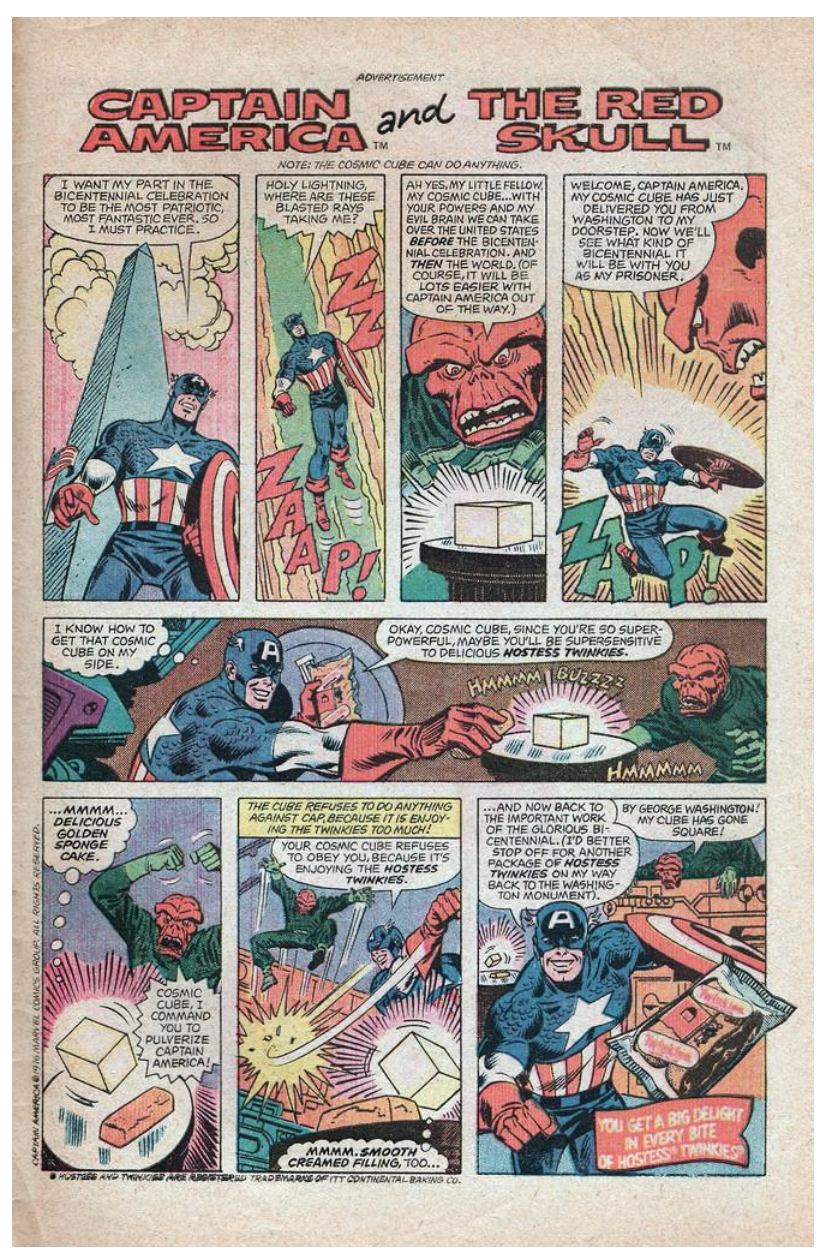
Fig. 7: Twinkies advertisement featuring Captain America and The Red Skull