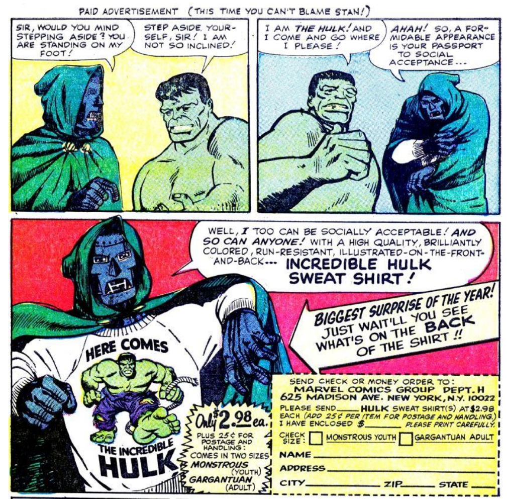
Fig. 4: Advertisement for Incredible Hulk-sweatshirts

showed that Doctor Doom did appear, in an advert for an Incredible Hulk-sweatshirt (cf. fig. 4)