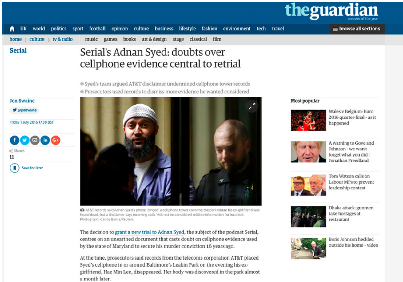
Figure 5. Adnan Syed Update, The Guardian, 1 July 2016.