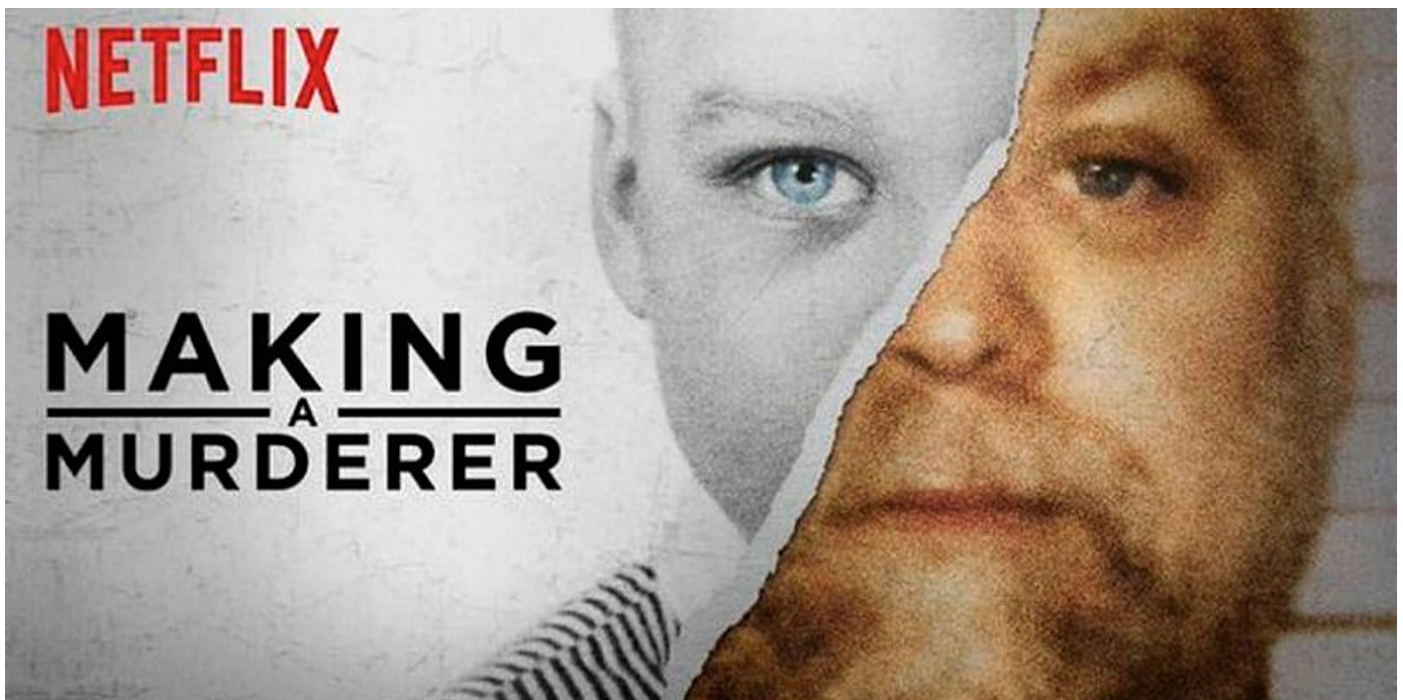
Figure 1. Making a Murderer Titles.

The opening episode of the American documentary series Making a Murderer (2015) introduces the story of Steven Avery, a man who is wrongly convicted of rape in 1985 and as a result spends the next eighteen years of his life in prison. We see how these lost years are followed at first by a seemingly happy ending, as in 2003 Avery is released when DNA evidence clears him of the crime. We see Avery decide to file a lawsuit against the county that convicted and imprisoned him, a lawsuit that would total $36 million in damages. It is difficult to imagine, given the injustice suffered, that the suit would not be successful. Then, in a strange twist, Avery is arrested for rape again, and this time also charged with murder. The victim's name is Theresa Halbach.