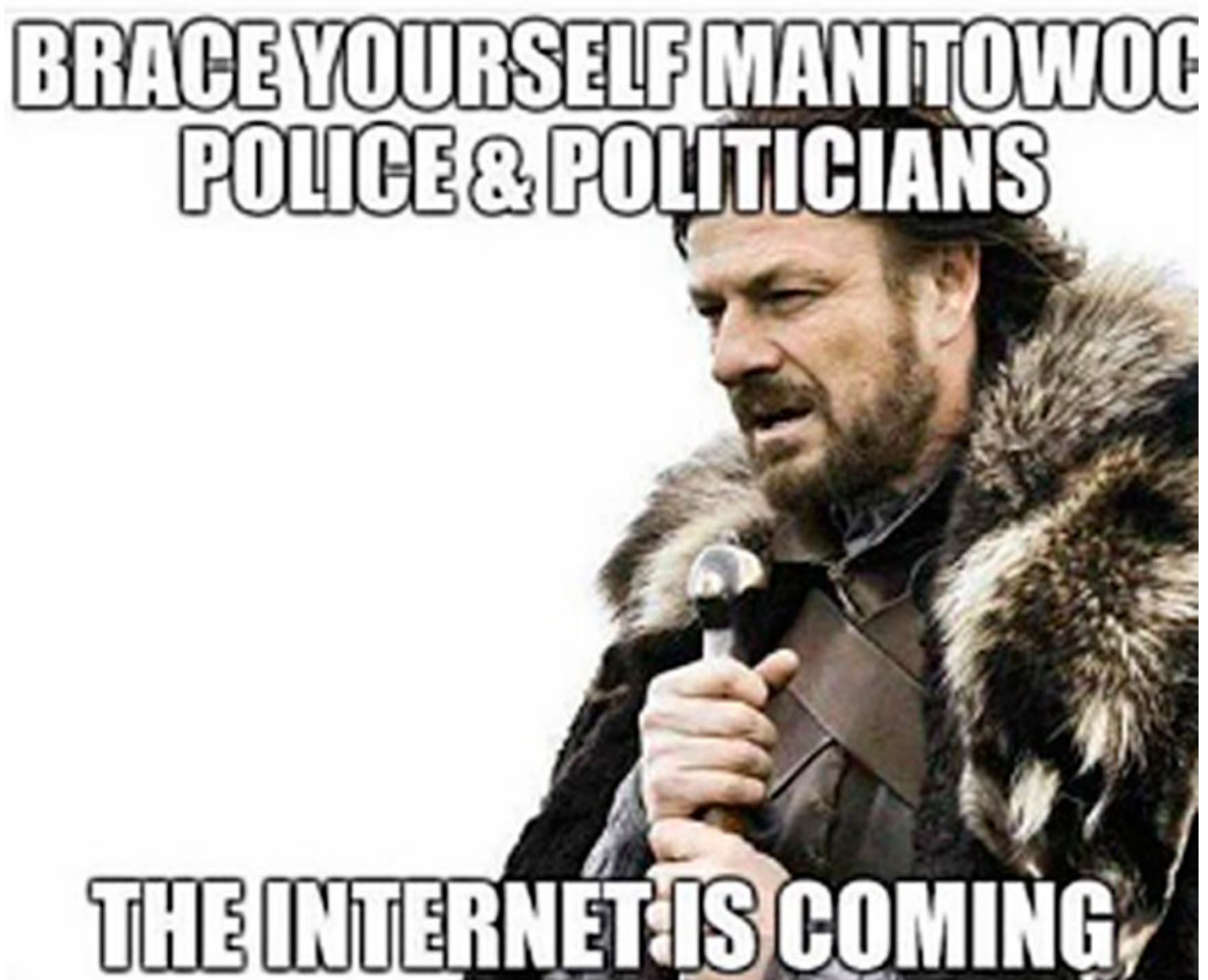
Figure 7. Making a Murderer and Post-Digital Writing.

The investigation, as a narrative, is open and in movement and adds depth to the media experience. 33 Not all of the puzzle pieces are clear, and the authors of the stories, both the series writers Laura Ricciardi and Moria Demos and the participatory audience who are continually writing and rewriting elements of the text outside of the fixed televisual content, aren't even aware of the final pieces of the puzzle, or what the final solution to the riddle is.