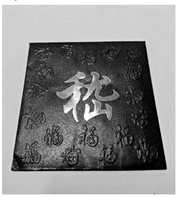
A red packet given to my nephews this year, bearing the word of my family name: JI

When I was little, the most exciting thing about New Year was waiting for midnight on New Year's Eve when my parents took out Red Packets to give to me—inside was brand new money. However, before they gave them to me, I had to say "gong xi fa cai, hong bao na lai", which means: "I wish you a good fortune,