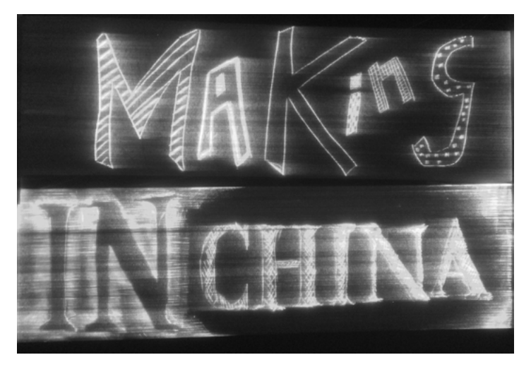
Figure 1: Distressed optical fibre "drawing", outcome of "Digital Lace" workshop co-created by Marshall and Rossi

for their presence in, and contribution to, the UK's lively making communities: community, creativity, entrepreneurialism and sustainability. Stage three consisted of a five-day visit to Shenzhen and consisted of visits to makerspaces, design studios and other related making sites, making-based workshops and a public-facing salon. Stage four was a reciprocal trip by Li and Liao to visit makerspaces and related sites in London, Bristol, Manchester and Amsterdam and participate in a workshop and salon with the authors and other project participants.