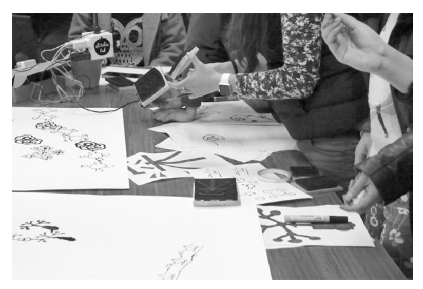
Figure 2: Laser-engraved printing blocks derived from participants' drawn designs

The three-hour evening workshop took place at Litchee Lab, which prioritises affordable access to analogue and digital design and making facilities and space for Chinese and international makers to meet and education. It was co-designed and delivered by co-director James Simpson.