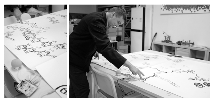
Figures 4 and 5: Final poster including the "touch board" and speaker that enables the audio files to be played

Simpson recognises the benefits of a dialogical, open-ended, "crafty" approach that perhaps can be contrasted with design workshops that aim for conclusive action and closure, rather than increased communication. As a sign of its success, Li and Simpson have repeated the workshop with a group of secondary school teachers, and it was again well received.